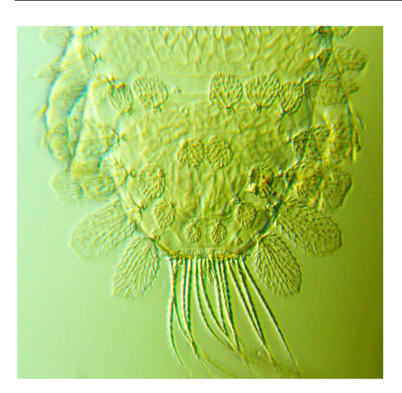
Figure 4. Dorsal view of opisthosoma of adult female Tuckerella pavoniformis.

Tuckerella pavoniformis was observed and collected on the branchlets and fruit epicarps of mamey (Figure 5). As aggregations of mites were more common, and the population densities were much higher (mean 10.6 mites/cm²), on the fruit than on the branchlets (mean 3.4 mites/15 cm of branchlets) (Table 1), we assume that the fruits represent the preferred feeding site for this species. Motile stages and eggs of T. pavoniformis are readily observed wedged within the crevices found on the epicarp of the fruit and on the surface