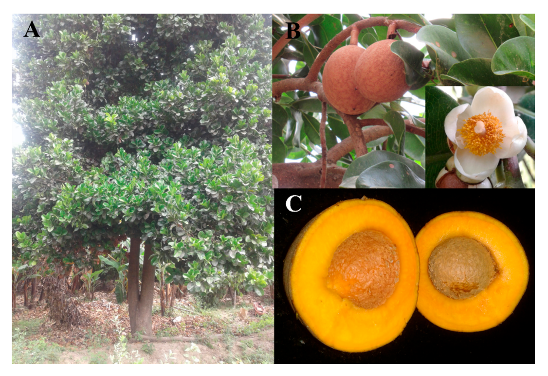
Figure 2. ( A ) Adult tree of Mammea americana L. (Calophyllaceae). ( B ) Detail of the fruits and leaves of mamey, with insertion of detail of the flower. ( C ) Cross sections of halved mamey apple fruit, M. americana .