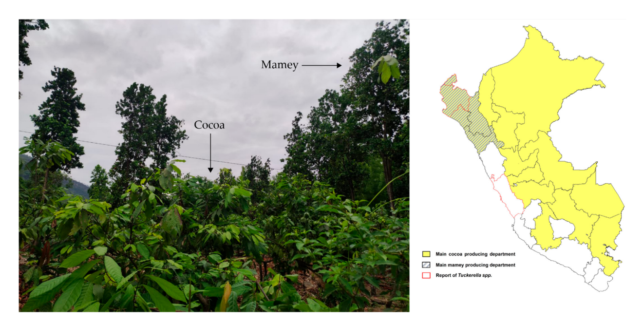
Figure 3. Current Tuckerella spp. distribution in Perú on mamey and cocoa crops.