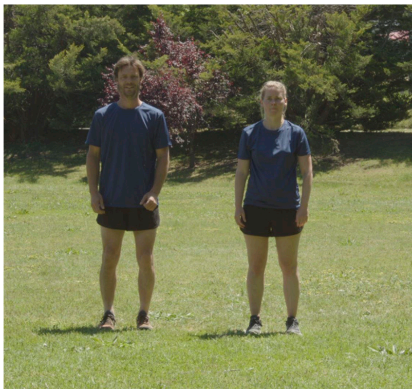
Figure 1. Video athletes.