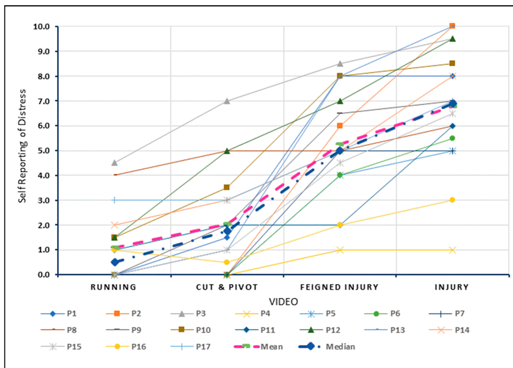
Figure 4. Self-reported distress viewing videos depicting increasing threat to the knee.

Figure 4 depicts the individual and group level changes for the rating of distress with exposure to the four levels of increasing threat. The linear mixed model results indicate a significant increase in distress for each increment. The largest increment between exposures for distress was also observed from cut and pivot (Video S2) to the feigned injury (Video S3) videos with an estimated mean difference of 3.2 (95% CI 2.3–4.2, p < 0.001 ). (Linear Mixed Models Analysis output is provided in Supplementary Material Table S2).