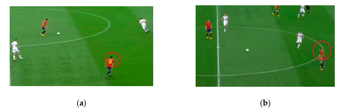
Figure 1. (a) Player (red circle) performs a scan by turning his head and looking away from the player in ball possession. (b) Player (red circle) performs a transition scan by turning his head and looking away from the player and the ball while the ball is in transition.

We defined a scan based on the definition of Jordet, as a body and/or head movement where the observed players look away from the ball with an active rotational neck movement in dynamic gameplay situations except while receiving the ball as shown in Figure 1a [14]. A transition scan was defined as a scan that was performed while receiving the ball, after the ball had already left the previous passer's foot and was in transition to the observed player as shown in Figure 1b. The third parameter was total scans, which is the sum of scans and transition scans. Scans, transition scans, and total scans served as independent variables for the regression analysis.