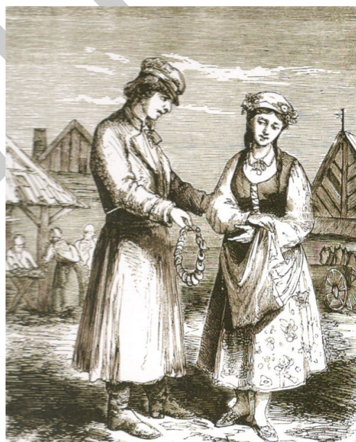
Figure 9. Young man gives the rolls to his girlfriend [13].

Kaminski's articles [13] about the traditions of the Ukmergė district were published in the journal "Illustrated Journal" in 1863–1864 and illustrated with drawings by Gerson and Kostrzewski (Figures 9 and 10). A young woman decorating her kerchief with flowers is presented in one of the illustrations. The same kind of kerchief tying and decorating was recorded by Romer and Zaleskis, albeit without specifying the location.