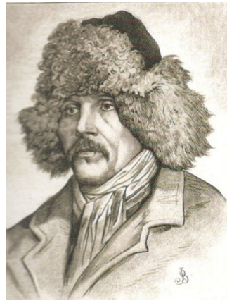
Figure 6. A resident from the Vilnius government Švenčionys district [56].

The work of Romer, the main artist in the second half of the 19th century [55], is known among ethnographers to be very good. The “Peasant from Švenčionys” [56] (Figure 6) was not published in the title page of the “Illustrated Journal” presenting knowledge about hats. Investigating the creative legacy of this artist, a few similar pictures of peasants with fur hats were presented.