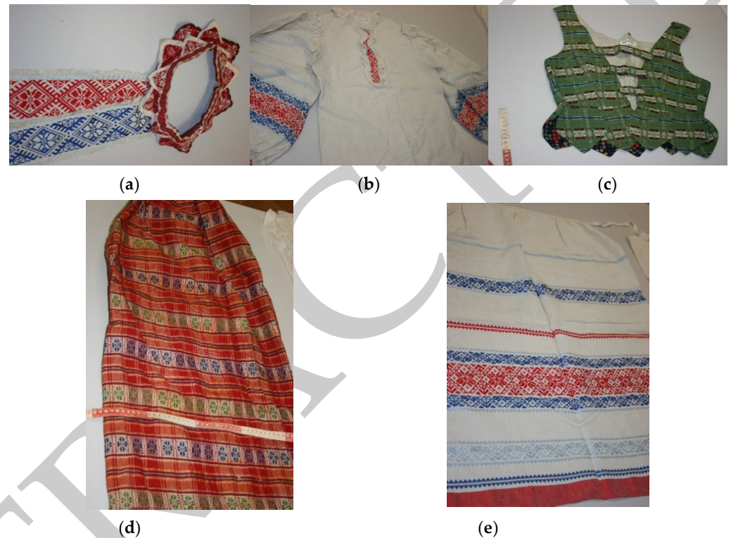
Figure 14. National costume from Aukštaitija in 1935–1940: (a) Crown ČDM E6360T; (b) shirt ČDM E6357; (c) vest ČDM E6358; (d) skirt ČDM E6356T; (e) apron ČDM E6359.

bright colours were popular in Southern Samogitia. The shirt's upright collar, clasps, and cuffs were often embellished with red cotton thread interweaves, and only the Southern shirts included tapered sleeves without cuffs. Vests were quite short; high under the chest; pierced and folded; and sewn from homemade checked, striped, and one-coloured fabric or industrial cashmere with flowers. Samples of Samogitian folk costumes are presented in Figure 15. Folk clothes of Samogitia were of brighter colours than those of Aukštaitija—people from Samogitia liked red colour. Samogitians are characterised by a distinctive vest cut, vertically striped women's skirts. Aprons also were vertically striped. Strips and small ornaments run along the apron. Samogitians wore several scarves, wearing mostly wooden clogs [25–33].