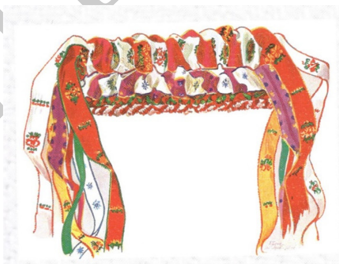
Figure 11. “Rangė” [61].

Not only fully completed costumes, but also separate parts of clothes were used as book illustrations at the end of the 19th century. The periodical journal “Illustrated Knowledge” was illustrated with watercolours from the Polish artist Turek in 1913 (Figures 11 and 12). Decorations of Samogitian girls—“rangės”—and watercolours of Samogitian female costume were made according to the researcher (mostly Samogitia history), archaeologist, and ethnographer Brenstein’s collection exhibits [61]. “Rangė” folded from white, red, and violet floral ribbons interested the artist. Exhibits of this type in Lithuanian museums are very rare.