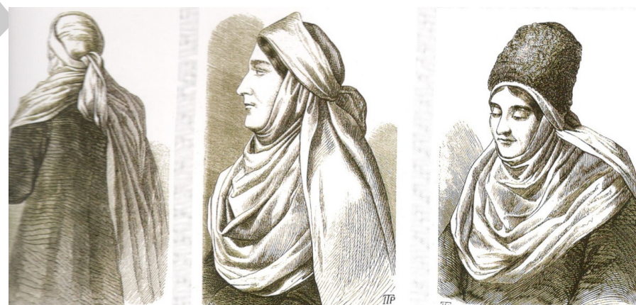
Figure 7. Married female headdresses [58].