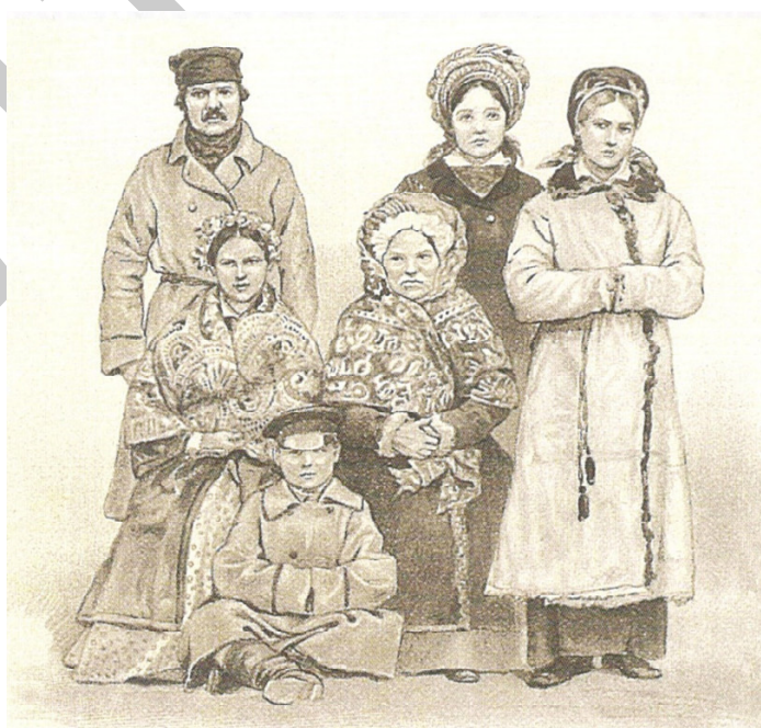
Figure 5. Lithuanians. The end of the 19th century [54].

Not much information is included in the later book “Russian nations” [54]. The introduction notes that the book aims to interest the reader by presenting short reviews and several drawings of Russian nations. The fifth page of illustrations is related to Latvians and Lithuanians (Figure 5). Four women, a man, and a child are shown as Lithuanians; it is noted that these are peasants from the Vilnius government Trakai district. Interestingly, Beliakin drew these people according to photos.