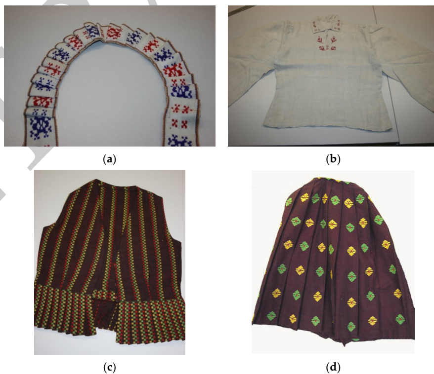
Figure 18. National costume from Dzūkija (from Varėna district): (a) Ribbon wrapped for the crown ČDM E3859e; (b) shirt ČDM E3859c; (c) vest ČDM E3859b; (d) skirt ČDM E3859a.