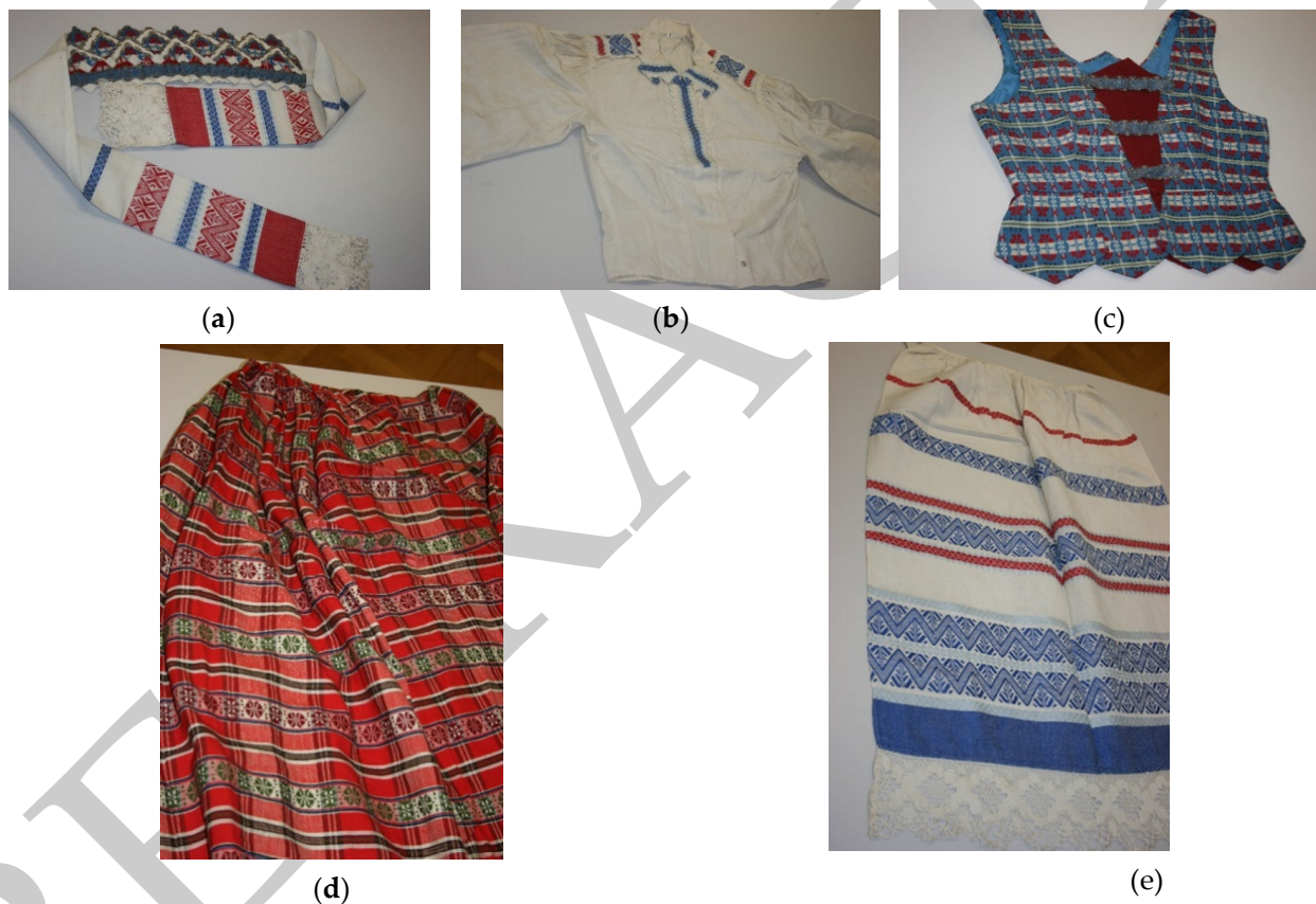
Figure 16. National costume from Samogitia woven by the company “Marginiai” according to A. Tamošaitis project in 1939: (a) Headdress—wide plain sash with collar ČDM E3711e; (b) shirt ČDM E3711a; (c) vest ČDM E3711d; (d) skirt ČDM E3711b; (e) apron ČDM E3711c.

preferred interwoven and embroidered geometrical ornaments with red “žičkai” on the sleeve ends and cuffs in the Prienai, Stakliškės, and Vievis districts. Stripes on the sleeve ends and shoulder pads were equally interwoven in the Eastern area. Due to the Slavic ornamentation, shirts embroidered with various ornaments were filled with red and black threads at the end of the 19th century. Women wore small wimples in Northern and Eastern Dzūkija, but the most popular headdresses were made of lace (later, crocheted hats and kerchiefs). Eyebrows were sewn from pleated fabrics with multi-coloured stripes and lace; decorated with glass beads, silk roses, gallons, and sequins; and featured fibres of multi-coloured thread attached to them. Women decorated themselves with a few rows of coral necklaces, as well as necklaces of multi-coloured glass. For economic reasons, coral beads were strung in a special way on threads of different lengths, and the ends of the threads were intertwined. The braid of the thread was only visible under the collar of the shirt, and several rows of necklaces of different lengths hung at the front of the neck. Samples of Dzūkija folk costumes are presented in Figure 17. According to written sources [25–33], Dzūkija is characterised by finely checked skirts, finely checked and striped aprons, overlaid and pick-up wide stripes.