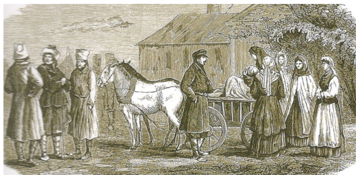
Figure 3. Lithuanians from the Ukmergė district [54].