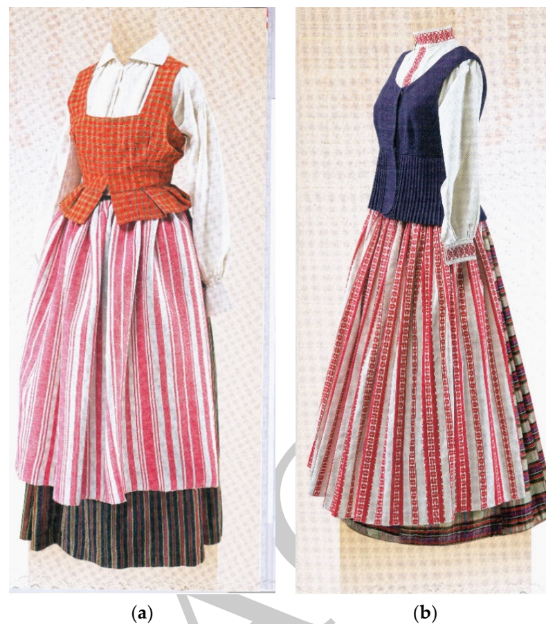
Figure 15. Folk costumes from Samogitia: (a) From Mažeikiai, Telšiai district, the 19th century: Skirt, A. and A. Tamošaitis gallery, Nr. 865; shirt LDM LA-1240; apron A. and A. Tamošaitis gallery, Nr. 903; vest LDM LA-2433; (b) from Raseiniai district, the 19th century: Skirt A. and A. Tamošaitis gallery, Nr. 858; shirt LDM LA-3019; apron A. and A. Tamošaitis gallery, Nr. 859; vest LDM LD-984/3.