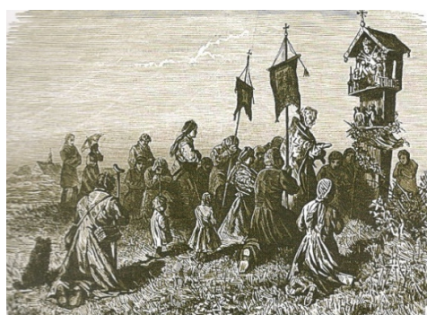
Figure 4. Procession in Samogitia [54].

Not much information is included in the later book “Russian nations” [54]. The introduction notes that the book aims to interest the reader by presenting short reviews and several drawings of Russian nations. The fifth page of illustrations is related to Latvians and Lithuanians (Figure 5). Four women, a man, and a child are shown as Lithuanians; it is noted that these are peasants from the Vilnius government Trakai district. Interestingly, Beliakin drew these people according to photos.