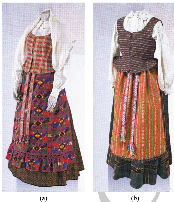
Figure 19. Folk costumes from Suvalkija: (a) From Šakiai district, the second half of the 19th century: Skirt LDM LA-1743; shirt LDM LA-4845; apron LDM LA-1792; vest A. and A Tamošaitis gallery, Nr. 833; sash LDM LA-1717; kerchief LDM LA-2768; (b) From the Kaunas and Prienai districts, the second half of the 19th century: Skirt ČDM E-1482; shirt LDM LA-3951; apron LDM LA-2115; vest ČDM E-1661; sash LDM LD-111.