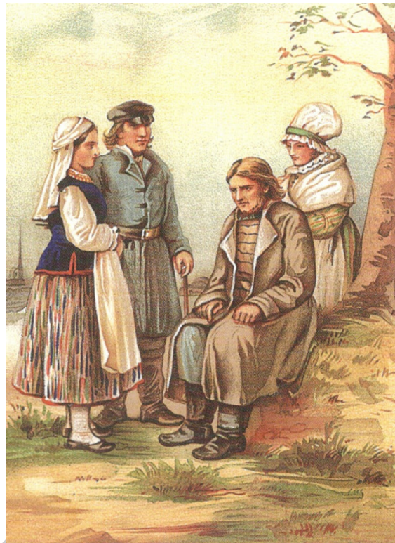
Figure 2. Lithuanians and Latvians [50].

The colourful lithography was then re-done. The same Lithuanians were re-drawn from Pauli's book and depicted in one drawing with a Latvian couple, as printed in the book "Russian Nations" [50] in 1877 (Figure 2). However, the album published by Pauli is unavailable due to its high cost. Consequently, Ilyin's Cartographic Company began to publish a more affordable book for consumers. The compilers explained in the preface that they do not intend to present any scientific summaries; their aim is only to present nations with drawings, with the texts included only in the annexes. These charmingly detailed drawings in Pauli's book are no longer present in the mentioned illustration.