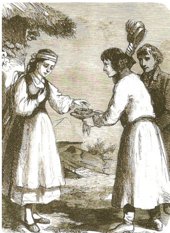
Figure 10. Mother gives of the wedding crown [13].

Not only fully completed costumes, but also separate parts of clothes were used as book illustrations at the end of the 19th century. The periodical journal “Illustrated Knowledge” was illustrated with watercolours from the Polish artist Turek in 1913 (Figures 11 and 12). Decorations of Samogitian girls—“rangės”—and watercolours of Samogitian female costume were made according to the researcher (mostly Samogitia history), archaeologist, and ethnographer Brenstein’s collection exhibits [61]. “Rangė” folded from white, red, and violet floral ribbons interested the artist. Exhibits of this type in Lithuanian museums are very rare.