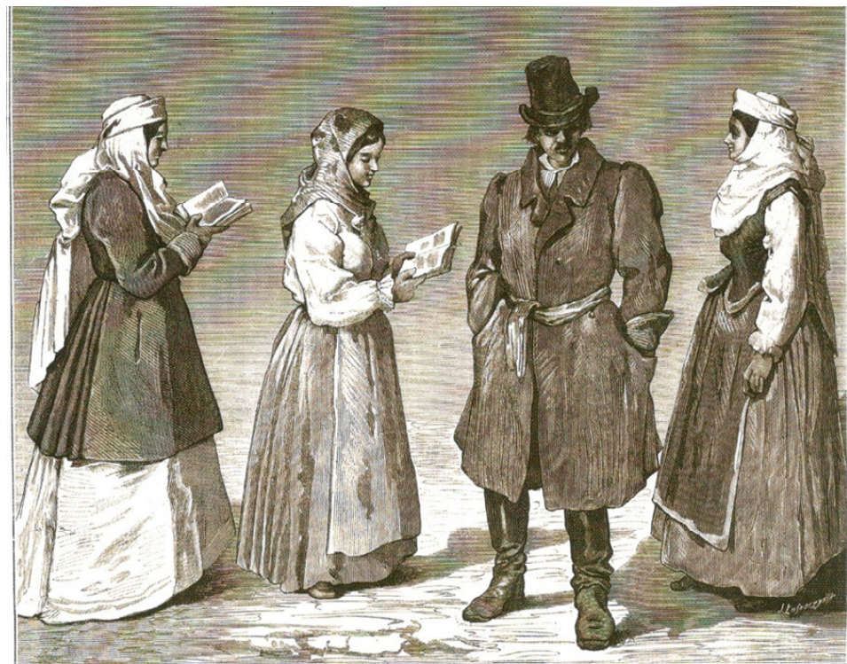
Typy litewskie. Rysował Alfred Römer. 840 Gubernia kowieńska, powiat dawniej wilkomiński, później jezioroński, dziś nowosiekandrowski. 1) Kobieta zamężna. Na głowie „samiotka“ lub „namitka“, zwykle z perkalu białego, rodzaj burmyś czy paltosa z prostego sukna, na zimą kożarskim buraniną podszytą; spódnica wełniana, a latem często jedwabna. 2) Dziewczyna, spódnica w domu tkana, bielona połobnie, chusteczka jedwabna. 3) Ubranie z samoznalu, zwykle w domu robione. 4) Także kobieta zamężna, gorset i fartuch wełniany lub adamaszkowy, karmazynowy. Spódnica wełniana, strój letni.—Ludność odznacza się dobrym bytem i wszystkim co za tym idzie, dobrą budową ciała i dość regularnymi rysami twarzy; włosy blond przeważnie, a bardzo często mężczyźni brunetów widzieć można, z rysami wydatnymi, o dużych nosach. Mowa litewska. Czytać prawie wszyscy umieją.