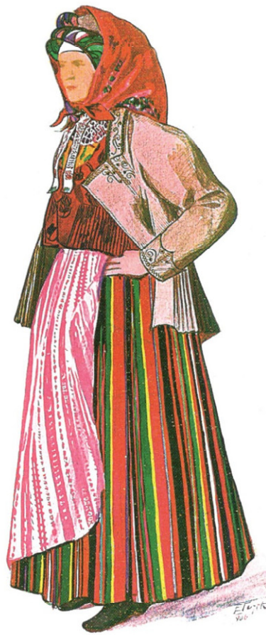
Figure 12. Samogitian woman [61].

Peasant clothes were already showing innovations at this time based on photographs from the second half of the 19th century to the beginning of the 20th century. There are many surviving photos from this period. Traditional clothes of this period were presented in one style, with national costumes shown in another style. Peasant clothes in photos taken by earl Tyszkiewicz [62] in Viala (not far from Minsk) are almost identical to the clothes worn in Eastern Lithuania in that period. The distribution area of hats with “ears” worn in Eastern Aukštaitija and shown in Viala is important for ethnographic research. Collections of the Russian scientist and ethnographer Serzhputovski and professor Volter, featuring clothes of Lithuanian peasants of the beginning of the 20th century, significantly added Lithuanian iconography found in the Russian Museum of Ethnography [63].