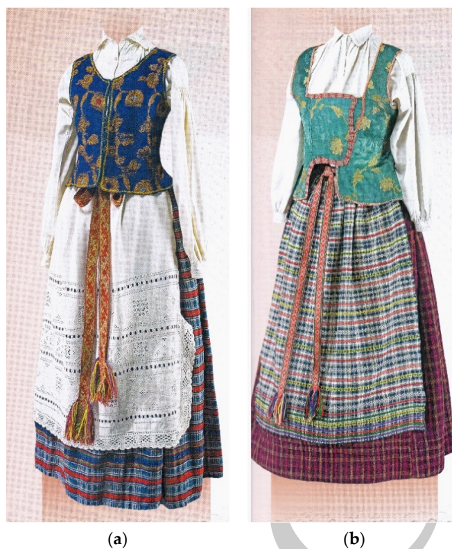
Figure 17. Folk costumes from Dzūkija: (a) From Kaišiadorys district, the 19th century: Skirt A. and A. Tamošaitis gallery, Nr. 878; shirt LDM LD-300; apron LDM LA-1442; vest ČDM E-4009; sash LDM LA-2272; (b) from Prienai district, the second half of the 19th century: Skirt LDM LA-2119; shirt LDM LA-2134; apron LDM LA-415; vest ČDM E-1618; sash LDM LA-2178.