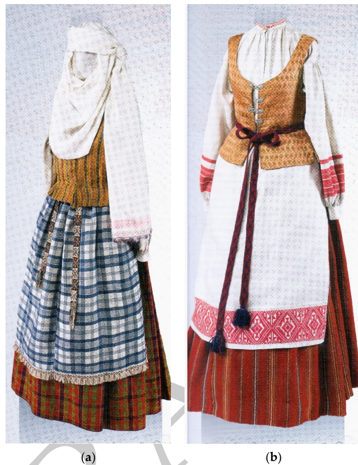
Figure 13. Folk costume from Aukštaitija: (a) From Rokiškis district; the 19th century; skirt LDM LA-1467; shirt LDM LA-1224; apron ČDM E-1038; vest ČDM E-1372; wimple LDM LA-1640; sash LDM LA-1521; (b) from Ignalina district, the second half of the 19th century: Skirt LDM LA-2333; shirt LDM LA-3778; apron LDM LA-3753; vest ČDM E-1368; sash LDM LA-3815.

separate pentagonal segments in national vests, while in folk vests, the bottom is usually wrinkled or pleated.