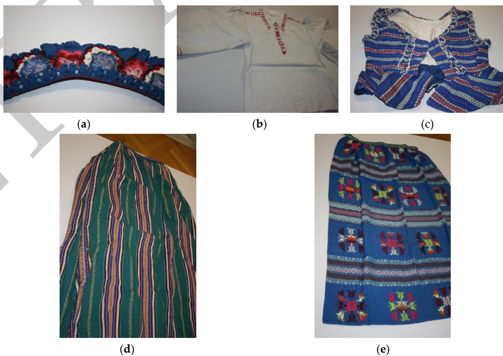
Figure 20. National costume from Suvalkija made by the company “Marginiai” in 1942: (a) Crown ČDM E6320; (b) shirts ČDM E6319; (c) vest ČDM E6318; (d) skirt ČDM E6316; (e) apron ČDM E6317.