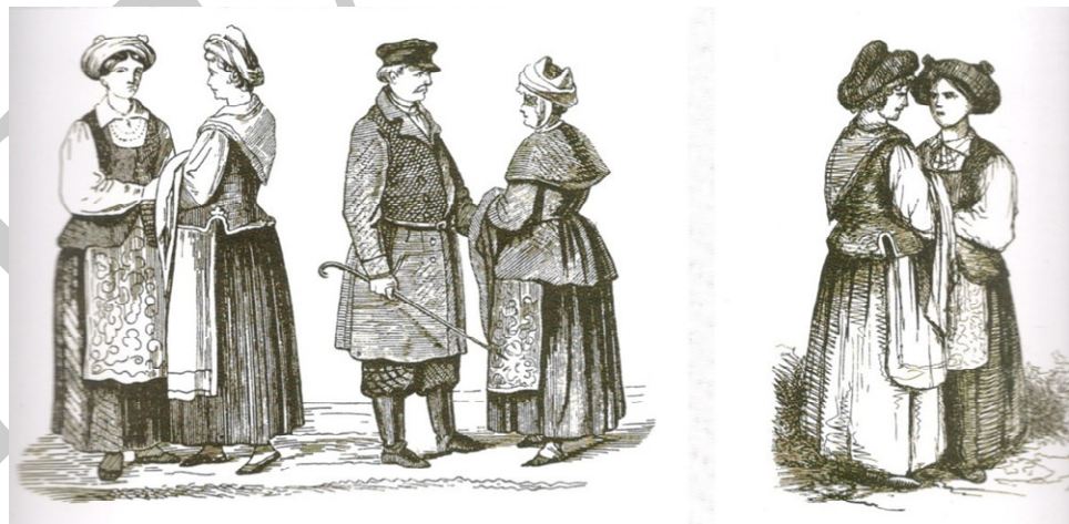
Figure 1. People from Mikališkės town [48].

People from present-day Mikališkės in Belarus (Astrav district) and their clothes are described in a few sentences by Tiškevičius, where images of five women and one man grouped into pairs are presented. Importantly, the author shows the limits of the territory populated by Lithuanians [48]. Such hats presented in Figure 1, often sewn from cashmere with flowers, are found in Lithuanian and Belarussian museums, and how these hats looked at the end of the 19th century to the beginning of the 20th century can be determined by photos.