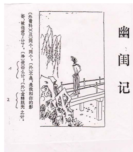
Figure 3. A dialogue in the Drama Report on a Lonely Woman's Chamber : [1] “Which stratagem?”; [2] “The cicada casts off of its skin of gleaming gold”.

In the drama Report on a Lonely Woman's Chamber (see Figure 3) by Shi Hui from the Yuan Dynasty (1271–1368), the war cloak of the persecuted son of a high dignitary who has just been killed by imperial order lies next to a well shaft. The two captors initially think that the son had thrown himself into the well and thus taken his life. Then, one of the captors says: “We’ve been taken in by a stratagem.” — “Which stratagem?” — “The stratagem «The cicada casts off of its skin of gleaming gold». He tricked us into looking for his body here. In the meantime, he’s long gone” (Sheng 2006).