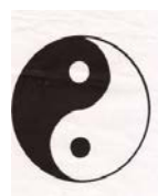
Figure 4. The Yin-Yang Symbol.

This concept is based on the ancient Chinese Yin-Yang symbol (Figure 4).