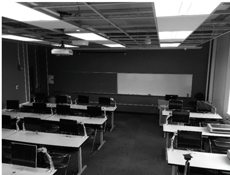
Figure 2. A sample of a classroom layout.