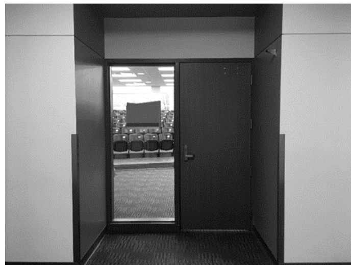
Figure 1. Shows a classroom door with a glass inset.

Of these 40 faculty members, one member declined to participate, and 22 members (55%) completed the survey. The participants were 11 males and 11 females, between the ages of 35 and 64, 53% of whom indicated that they hold at least one degree in a design discipline. Twenty participants indicated some familiarity with Building A, while two indicated no familiarity. All of the participants indicated high familiarity with Building B.