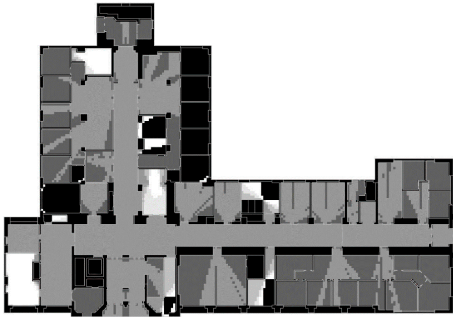
Figure 6. The visibility integration output of Building B, ranging in color from white (highly integrated isovists) to black (segregated isovists).

Results also showed that although both buildings were below the required level of intelligibility in floor plans, Building B had a better intelligibility value than Building A. This indicates that wayfinding in Building B is expected to be easier than wayfinding in Building A.