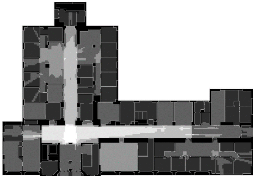
Figure 4. Shows the isovist area output for Building B ranging in color from white (high visibility area) to black (low visibility area).