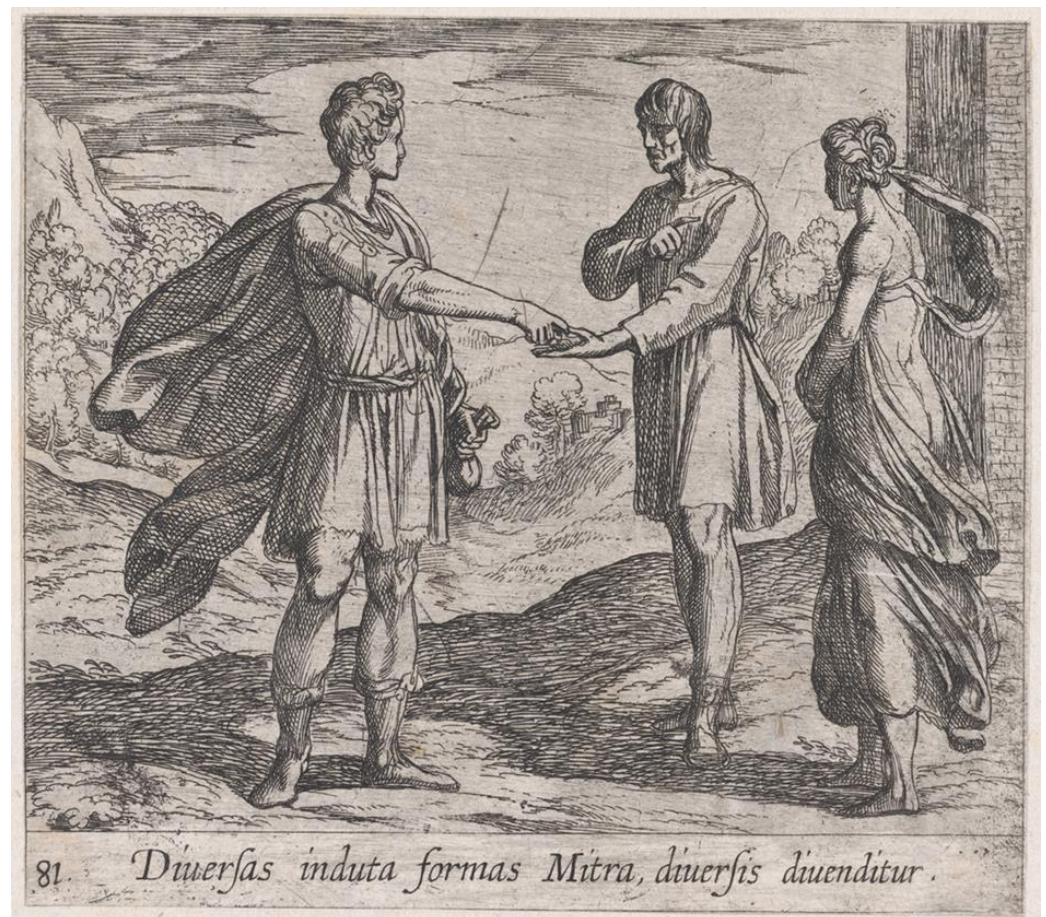
Figure 2. Antonio Tempesta, Plate 81: Erysichthon Selling his Daughter ( Diversas induta Mitra diversis diuenditur ), from Ovid's 'Metamorphoses' 1606, Etching, Dimensions: 103 × 116 mm).

in resonance (Deleuzian breakdown of genetic conditions of thought, Farockian ideological critique and Rancièrian dialectic of fable and image) to serve the ends of fragmentation and pluralization characteristic of cosmotechnics. These actions disengage the sensory-motor circuit, open a state of intensive variation or crystal image, and bring forth the unevenness of times, which in the context of contemporary art Danh Vō terms estrangement. We identify this model of Simondonian/Deleuzian modulation = individuation as a social process with Maestra, the daughter of Erysichthon. Maestra possessed an ability to shape-shift that Erysichthon exploited. He sold her into enslavement on the assumption she would be able to escape and then repeated the process when she did. In an etching by Antonio Tempesta from a 1606 edition of Ovid's Metamorphoses , we see Erysichthon's pointed finger commanding his daughter (Figure 2). One day she faithfully returned to find her father consuming his own flesh, at which point she took on the form of a hind and left. In a similar manner, living on Earth means unlearning the imperatives of control society, breaking with navigational techno-economic homogenisation, and embracing cosmotechnical becoming as the end of modulation.