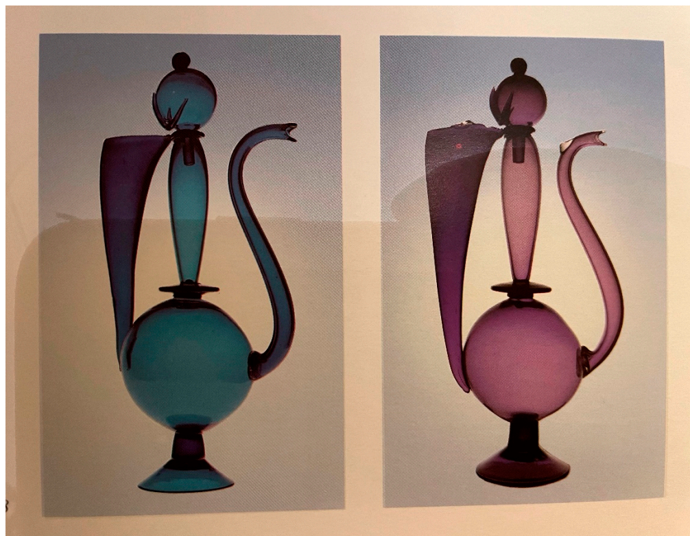
Figure 6. Aquaioloa . Credits: Attilio/Luigi Costantini (Licht and Lader 1990, p. 158).

fairy tale on account of an occidental tradition of storytelling. Different from these but yet characterised by a fabled poetry are his vessels that conjure up notions of The Book of One Thousand and One Nights ( The Arabian Nights ) with Aladdin and his magic lamp being the main point of reference for the orientalisising forms (Figure 6).