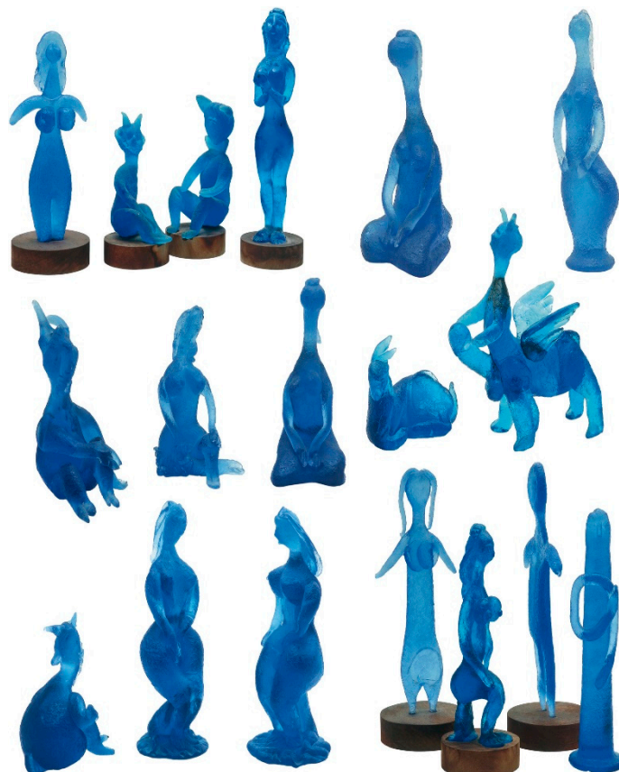
Figure 2. Twenty-three glass sculptures after sketches by Picasso (1964). Credits: Egidio Costantini (1912–2007). Poured glass. Between 10 and 30.5 cm high. Peggy Guggenheim Collection, Venice (Solomon R. Guggenheim Foundation, New York). 76.2553 PG 294.1–.23. https://www.guggenheim-venice.it/en/art/works/twenty-three-glass-sculptures-after-sketches-by-picasso/ (accessed on 21 December 2023).

It is an expression of pure delight over holding the vitreous creation in his hands, the physical manifestation of an almost magical transposition of his two-dimensional drawings to three-dimensional form. Following the first essays in the 1960s, further projects take shape over the course of years that result in such iconic works as Twenty-three glass sculptures after sketches by Picasso (Peggy Guggenheim Collection Venice) (Figure 2), Donna and Capretta from the 'Nymphs and Fauns' series (Kunstmuseum Walter Augsburg) or Anfora (Fondazione Oderzo Cultura) (Figure 3). 1