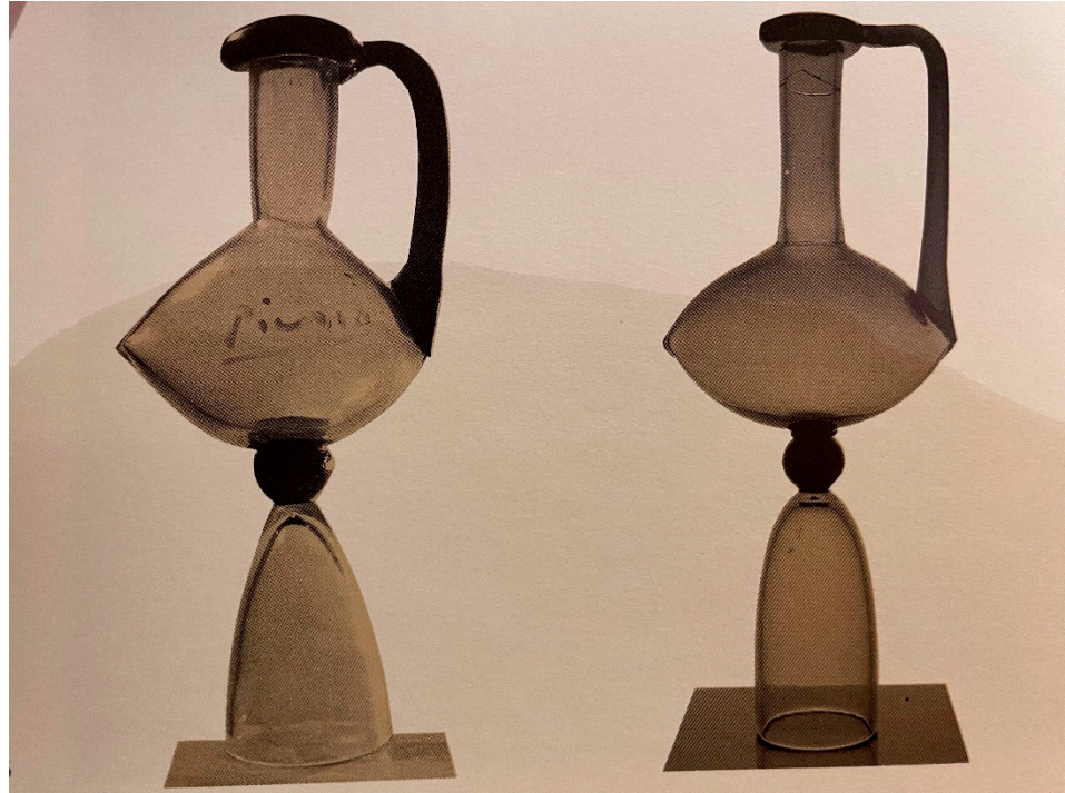
Figure 5. Picasso signing the Anfora Preciosa with lipstick.

for the first time, wished to sign it. Given the nature of the material and thus the inherent impossibility of doing so, he asked his wife Jacqueline for her lipstick with which he swiftly put his name on the sculpture (Rizzi 1986). Moreover, than illustrate Picasso's newly sparked passion for the medium the anecdotal account underlines one of the caveats glass comes with for artists. Its very caprice demands specific ways of handling, thus effectively conditioning the approach to it and marking it as radically different from other materials Picasso was accustomed to working in.