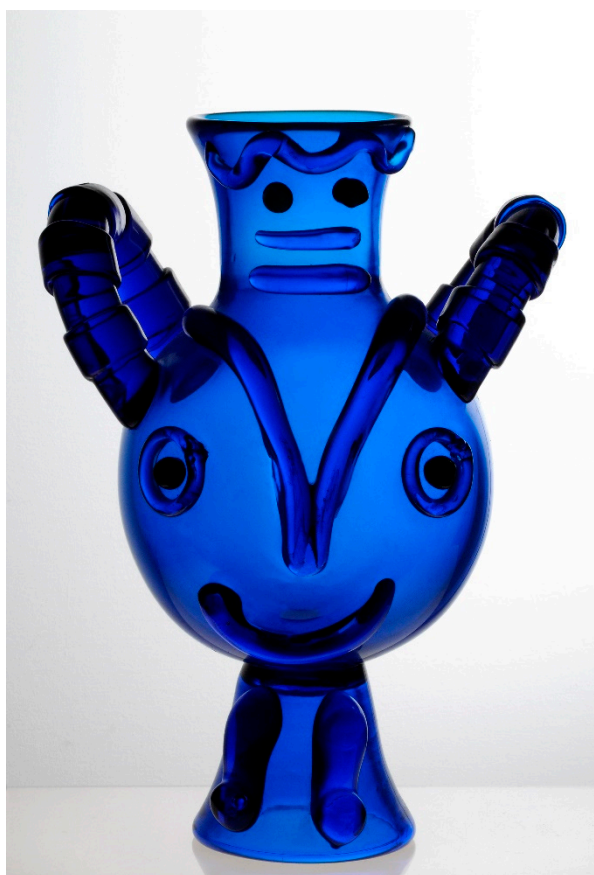
Figure 3. Anfora (1962). Credits: Fondazione Oderzo Cultura Onlus. https://www.oderzocultura.it/taglio-del-natro-per-la-collezione-zava/ (accessed on 21 December 2023).

Whilst Picasso could freely work most materials, the realisation of his blown glass sculptures required the involvement of a ‘maestro vetraio’, the so-called master glassmaker, thus resulting in a distancing between artwork and artist conditioned by the nature of the medium. A predicament that may however be overcome by reverting to the process of glass casting, an ancient technique which in modern times has witnessed a revival. However, as a form of potentially mechanical reproduction, it bears the risk of negatively impacting on the work’s aura in the Benjaminian sense since the one-off piece is readily turned into multiples. Picasso’s glass sculptures executed in both techniques accordingly lend themselves to a comparative approach that allows for a juxtaposition of artistic-manual procedures and their influence on the artist’s respective iconography.