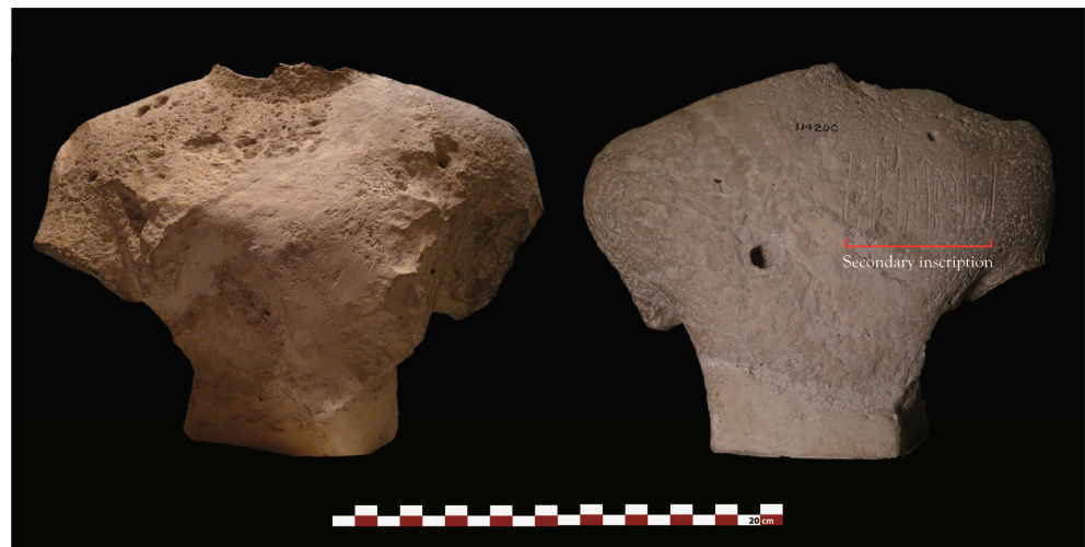
Figure 3. Statue of Ekur/Kurlil [BM 114206] from the British Museum. © 2023 Imane Achouche.

Much could also be said about its state of preservation, since it is particularly damaged in an archaeological context where the majority of other artefacts were found in good condition. Thus, Julian Reade proposes a deliberate attack on this particular representation (Reade 2000, p. 83). The fourth case is in a poor state of preservation too, and the lack of diagnostic features such as the head or inscriptions is a limiting factor in the study of reuse and its circumstances.