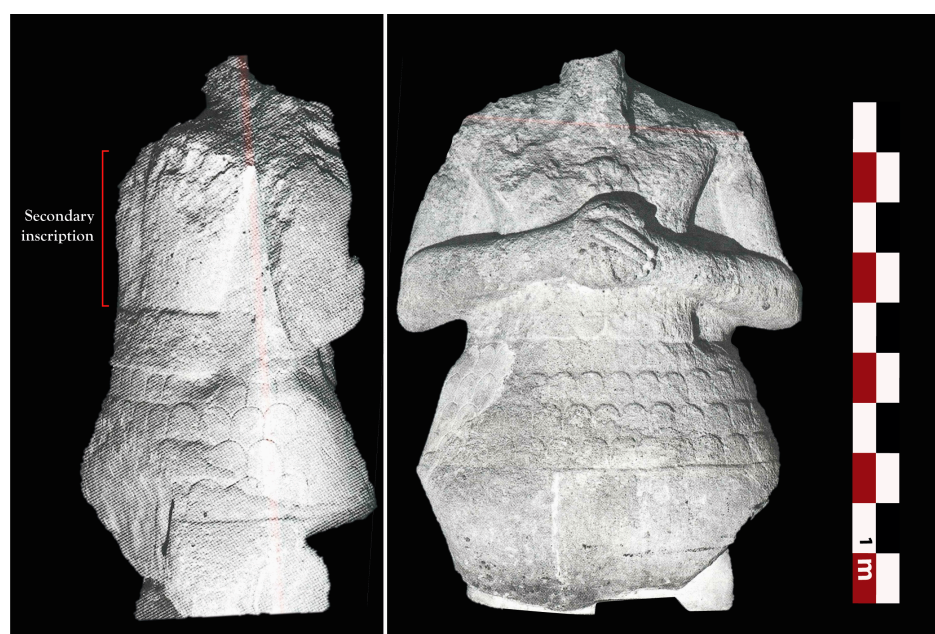
Figure 4. ‘Statue Cabane’ [M 7917/1326] from the Aleppo Museum. © (Moortgat-Correns 1986, pl. 36.1 & pl. 37.6).

U. Moortgat-Correns also noticed that no trace of reworking was visible, not even the removal of an earlier inscription that would have been replaced by that of Yasmah-Addu (Moortgat-Correns 1986, p. 186). However, we must not lose sight of the state of conservation of the artifacts examined. Nonetheless, the elements of the head (headdress, facial features) would have been the first to be modified if this were to be done, but many statues—including this one—have been decapitated. However, as we have seen, usurpation does not necessarily require the adaptation of the features of the representation, as the addition of the inscription may be enough. The following statue is of particular interest in this respect.