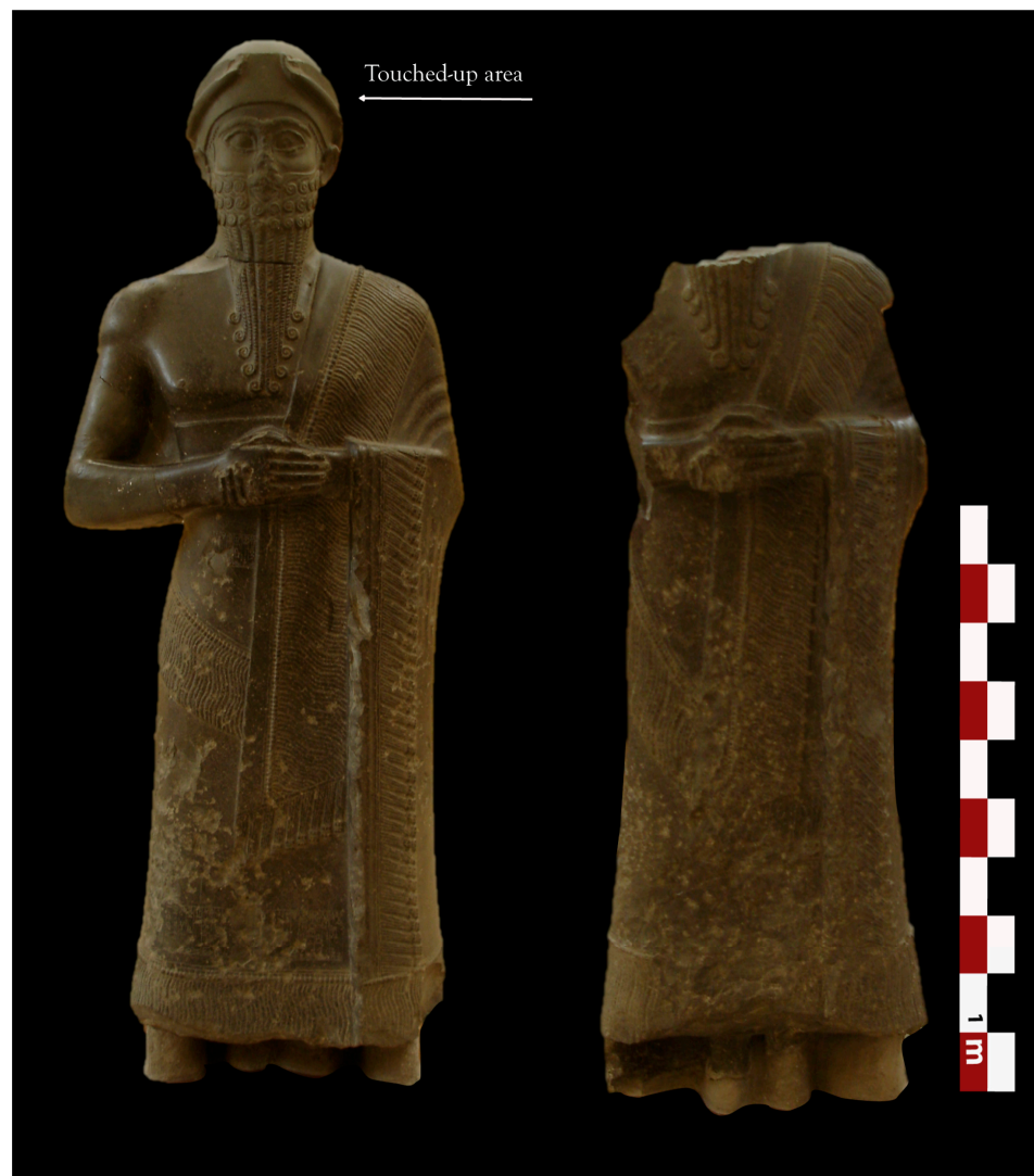
Figure 6. Left: Statue of Puzur-Eštar [EŠEM 7813]. © Laurent Colonna d’Istria (2007). Right: Statue of Puzur-Eštar [EŠEM 7814]. © Laurent Colonna d’Istria (2007).