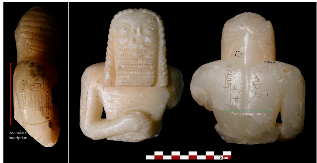
Figure 5. Statue of Urlammarak [BM 91667] from the British Museum.

At one point, E. Braun-Holzinger proposed that the inscription on the back was a later addition too. According to her, this sculpture in the round was an imitation of an Early Dynastic Style (E. A. Braun-Holzinger 1977, p. 75). Then she suggested that it was the reuse of a statue that had been reworked to give it an older style (E. Braun-Holzinger 2007, p. 44). These supposed traces of retouching work are to be seen in the holes drilled in the nose and scratch marks on the forehead. She thus suggests that the hair and eyes must also have been modified (E. Braun-Holzinger 2007, p. 44). However, the elements in question could very well be traces of repair, as attested in Mesopotamia. In any case, the reuse of the statue is illustrated by the addition of the shoulder inscription whether the image features have also been retouched or not.