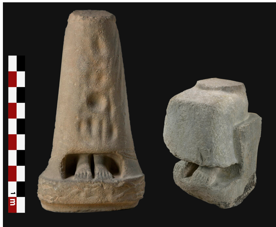
Figure 7. Left: Statue of Puzur-Sušinak [Sb 48]. Courtesy of the Musée du Louvre (Raphaël Chipault 2023). Right: Statue of Puzur-Sušinak [Sb 55]. Courtesy of the Musée du Louvre (Raphaël Chipault 2023).

In the end, this sculpture was reassigned, either as a result of a deportation from Mesopotamia, when it became part of the spoils of war, or as a result of a change of context within the city of Susa itself. Indeed, the traces it bears most certainly testify to wear related to a use that is difficult to identify, the pivot stone being one of several possibilities. The other way round is also possible, since Sb 55 (H: 84 cm) is often considered to have been usurped by Puzur-Sušinak, as the type of clothing appears older, probably from the period of Maništušu (rigid, formal, wavy folds) (Strommenger 1959, p. 37; Amiet 1972, p. 103). Although J. Álvarez-Mon also acknowledges the foreign features—mainly the presence of the sandals—he is again more inclined to the theory of Akkadian inspiration, rather than the result of looting (Álvarez-Mon 2020, p. 281). When the initial origin of the representation is identified by an inscription and differs from the place where it was found, the study is more straightforward. This is the situation presented next.