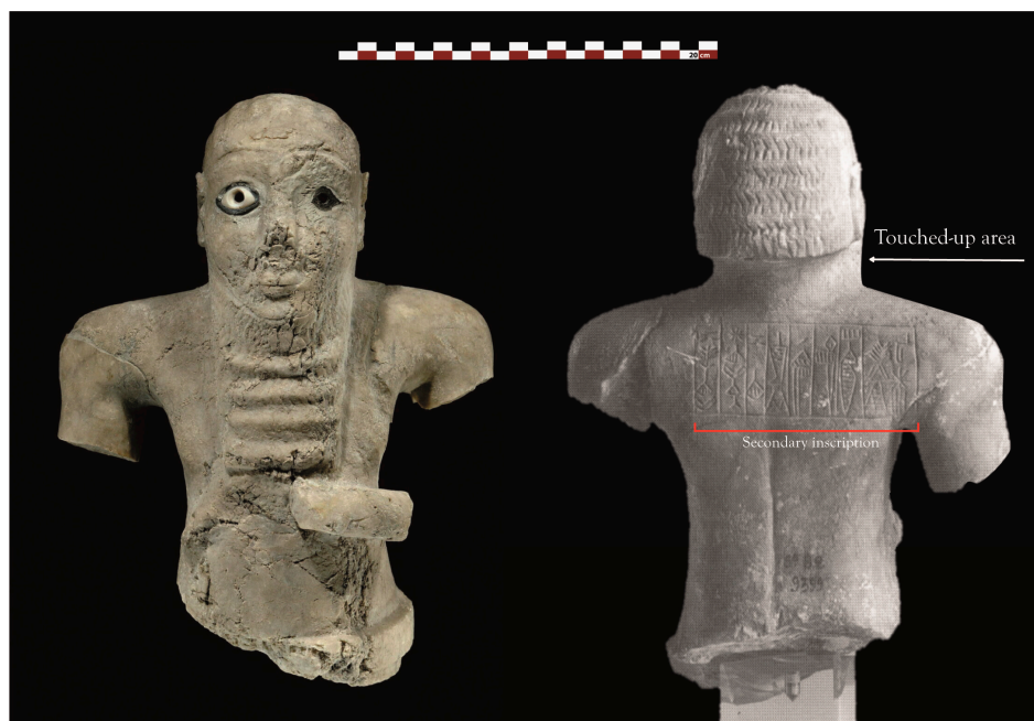
Figure 2. Statue of Maništušu [Sb 82] from the Louvre. Front: ; Back: (Strommenger 1959, 31, pl. IIb).

distinctive beard leads her to believe that this is a local Elamite production, but designed for the Akkadian ruler (E. A. Braun-Holzinger 1991, pp. 257–58). Due to the lack of evidence of Elamite productions of this type, this remains to be studied with hindsight (Evans 2012, p. 230). E. Strommenger responds that, stylistically, the statue strictly follows the codes of earlier style in the 3rd millennium BC. She also rejects the possibility of an ancient inspiration, as the retouching work carried out on the hair bears witness to a period of modification of the work which supports the idea of an usurpation (Strommenger 1959, pp. 34–36). A similar discussion arose regarding the next representation, discovered in southern Mesopotamia.