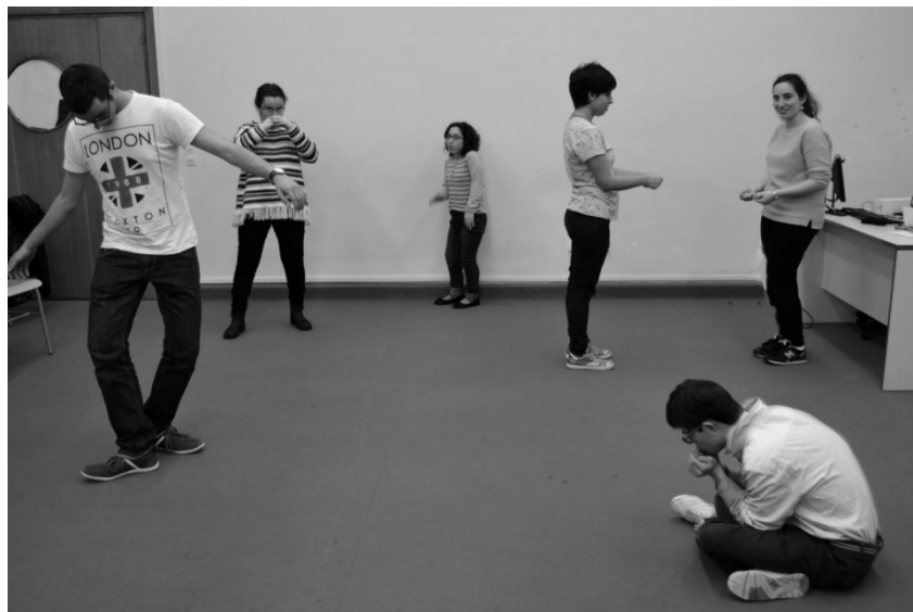
Figure 1. Group sculpture.

One of the group sculptures represents a break time in a school (Figure 1).