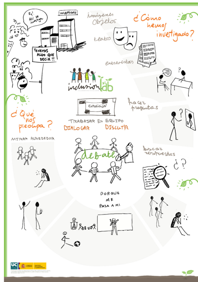
Figure 4. Poster of the research process used in the exhibition. (From left to right and from top to bottom: We have something to say/How did we conduct our research? Images, objects, theater, asking questions, looking for answers. Which concerns us? Looking around us. Working as a team: dialogue and discussion).

Similarly, research processes cannot merely feed the expert role of the academic researchers (extractive research). We believe that academic standards (implementation times, publication rules, etc.) may weaken the principles on which inclusive research is based. Therefore, it is necessary to ensure that there is enough time to stop and think about the ways in which we move forward in research in order for it to be truly transformative. As some works highlight (Ellis 2018), it is possible for research discourses and practices to move in opposite directions if we do not stop to think about it. We agree with Chalohanová and colleagues that “time is needed to relax into relationships that are allowed to build slowly and organically” (Chalochanová et al. 2020, p. 155).