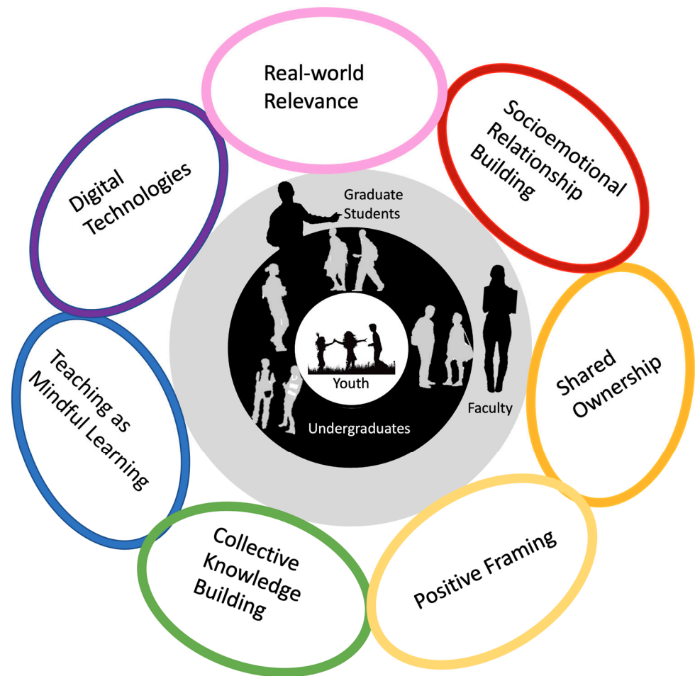
Figure 2. Reported key qualities of engagement in New Leaf.

As described earlier, members in New Leaf are concentrically organized on the basis of their respective positions and roles in the program, establishing the concentric configuration in the above illustration. All of the participants agreed with the presented interpreted qualities of engagement (see Appendix A) that are reflected in the surrounding linked rings above, which are deliberately connected given the observed overlap in how participants expressed their thinking. According to the undergraduates, engagement reflects a democratic, mindful effort of acceptance and acknowledgement of knowledge and expertise of all others, young and old. The undergraduates agreed that such engagement should also reflect the digital era that we live in, and expand the number of connections and ways of communicating with one another. Each of these seven qualities of engagement is described in turn.