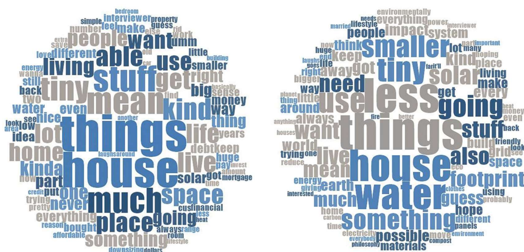
Figure 5. Word clouds for Motivator 4. The left cloud represents most frequent responses in the personal motives’ category. The right cloud captures word frequencies for the mixed motive category. Note: The word “things” in both clouds occurs in interview contexts where people talk about wanting to “get rid of”, “reduce” or “do” things with their newly found freedom.

All interviewees stressed that they wanted to live a “simpler lifestyle in a smaller space”. For many, this meant finding ways to reduce their belonging to the “most essential”, letting go of “nick knacks”, and/or reconsidering the “stuff” they bought or were “bringing . . . home”. A closer analysis of the interviews, however, suggests a more nuanced picture as to why people want to live simple. While all interviewees gave reasons for how simplifying their lives and going tiny benefited them personally, some stressed these personal motives exclusively, while others discussed mixed personal and environmental motives (also see Figure 5).