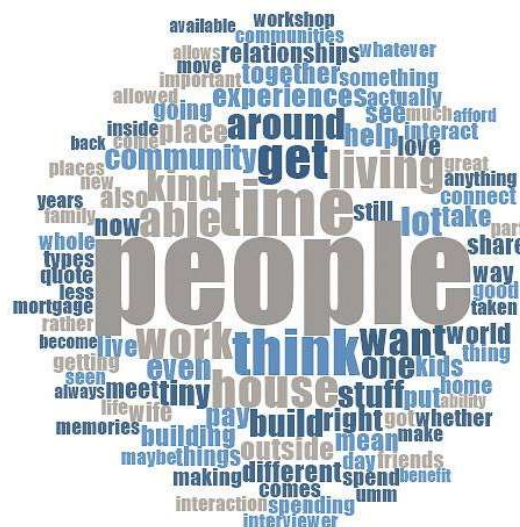
Figure 4. World cloud for Motivator 3.

Many TH enthusiasts also yearned to interact with people and build relationships (also see Figure 4). Many alluded to the fact they had "forgotten . . . how to talk to people" and "lost . . . [the] connection to other people." Larry, for example, laments how the "family unit . . . has been disrupted" because nowadays "there is not a lot of family time." In his eyes, people do nothing more than "work [to] pay taxes, . . . utility bills, . . . insurance bills [and] . . . mortgage." Freeing them from constraints placed upon them by contemporary life, the TH lifestyle is seen as opening up new horizons "to meet people" and spend "more time with each other". To some, living tiny even promotes communication, because space makes people "work out the problems right then and there."