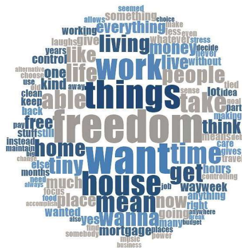
Figure 3. Word cloud for Motivator 2.

Eighty three percent of participants expressed a deep desire to take back their lives. Many TH enthusiasts saw living tiny as a gateway to “being in control of . . . life” or at least help to “redefine where the quality of . . . life [should be].” While often couching it in the language of wanting “more time and money”, many interviewees expressed “want[ing] out of it”. Seeing their mortgage, debt, long work schedules, and the consumerist lifestyle as contemporary forms of “slavery”, they longed to break free from oppressive structural forces that they felt held them back from the rich and fulfilling lives they longed to have (also see Figure 3). To attain this true sense of autonomy and overcome the grips of what Brittany called the “American lie”, many TH enthusiasts stressed that one needed to go beyond the simple idea of freedom from and embrace the much richer and much more genuine freedom to orientation to life (Fromm 1941).