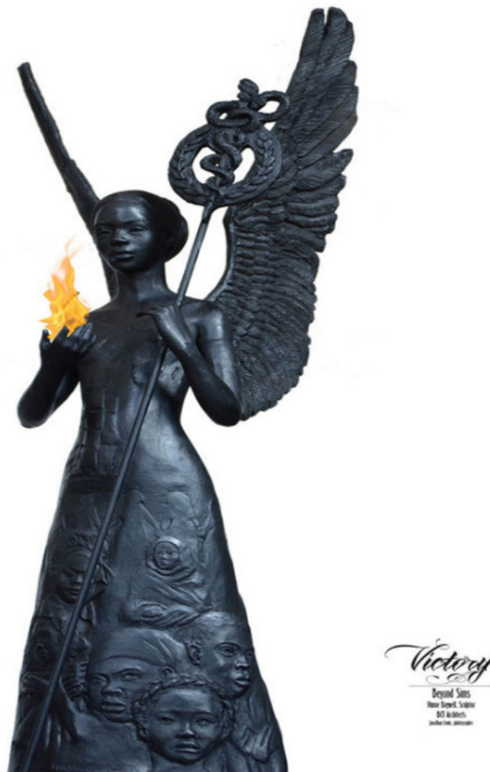
Figure 5. “Victory Beyond Sims” Rendering, by Sculpture Vinnie Bagwell Image Source: Artforum.com (accessed on 12 December 2020).

Importantly, a connection between black women’s poetry and mobilization for health equity and wellness can be traced back to Audre Lorde’s Cancer Journals (Lorde 1980) and A Burst of Light (Lorde 1988) and also to U.S. Poet, Civil Rights activist and memoirist, Maya Angelou’s legacy project at Wake Forest University—The Maya Angelou Center for Health Equity.