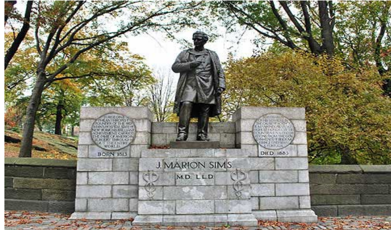
Figure 4. Image Dr. J Marion Sims Statue, New York's Central Park. 2013.

lives and legacies of the enslaved women in this history and interrogating structures of race, gender and power in relation to the telling of this story (see for example Daly 1978 ; Washington 2006 or Finney 2013 ).