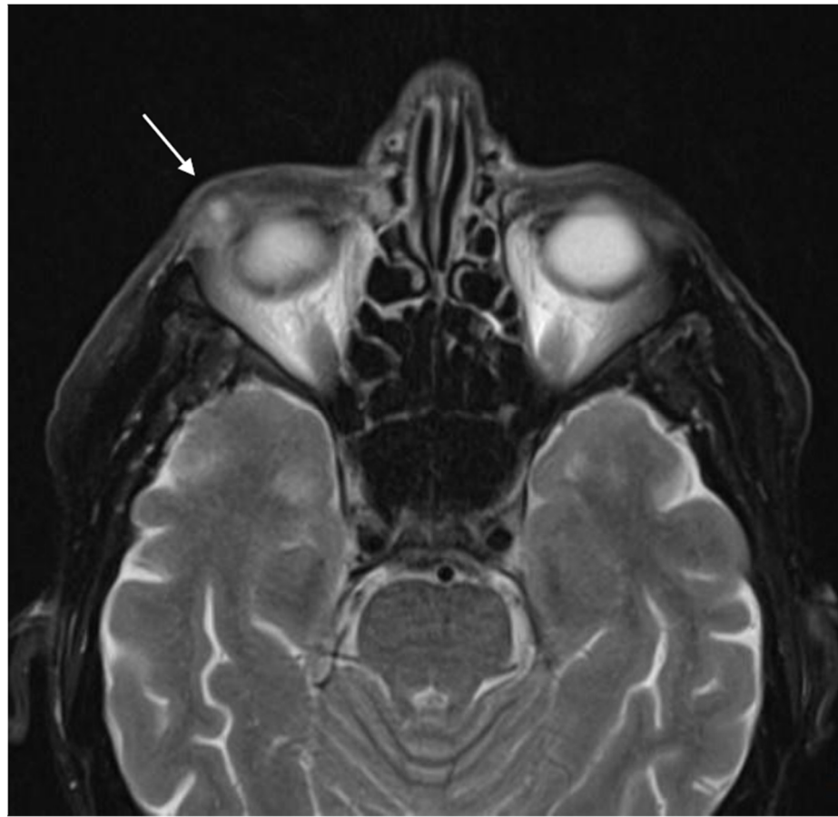
Figure 2. A CT scan showed a round, well-defined mass in the lower right orbit (arrow).