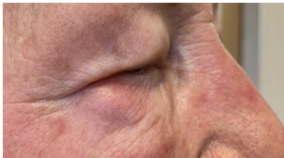
Figure 1. (A,B) This 78-year-old woman had three weeks history of sudden and non-specific swelling in the lower right orbit.