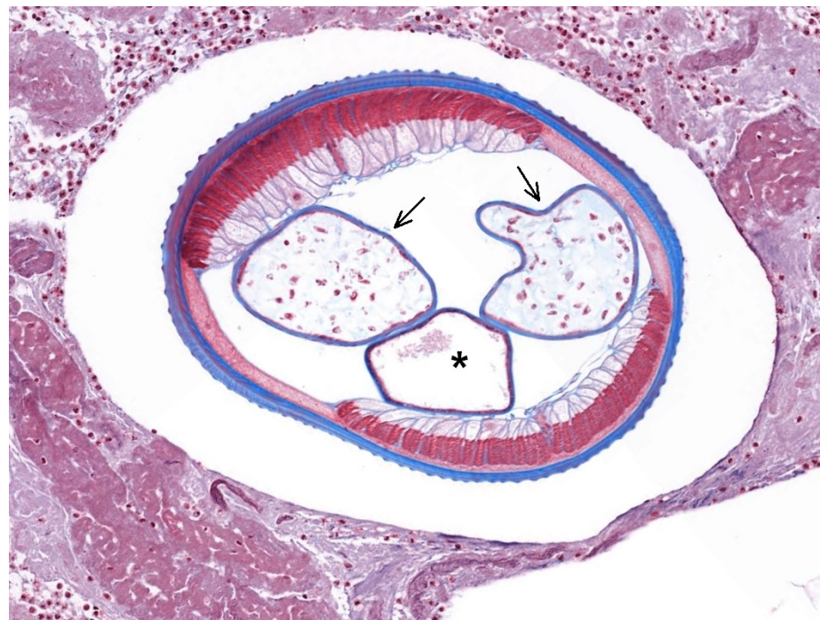
Figure 3. Cont.