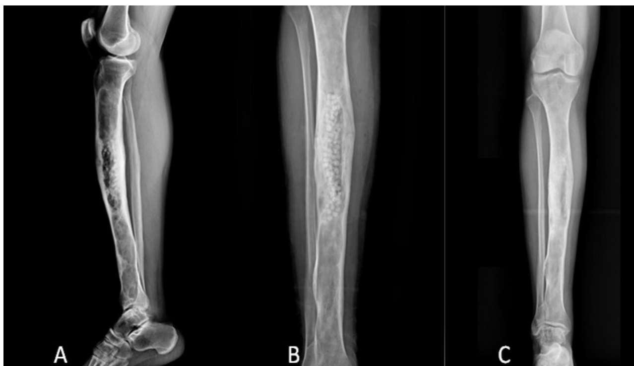
Figure 2. X-rays of the leg in a patient treated with debridement and adjuvant PerOssal bead for a chronic osteomyelitis of the tibia diaphysis. (A). Post-operative lateral view X-rays. Antero-posterior X-rays showing no filling at 6 months of follow-up (B) with complete filling at 12 months of follow up (C).

(20.7%), with partial filling in 24 cases (41.4%) and complete filling in only 22 cases (37.9%) (Figure 2).