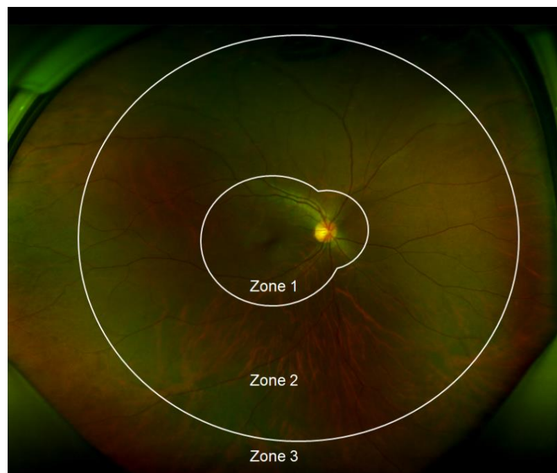
Figure 2. Zones involved of cytomegalovirus (CMV) retinitis. Zone 1 is defined as the area within 1500 \mu\text{m} of the optic nerve or 3000 \mu\text{m} of the fovea. Zone 2 includes the area outside from Zone 1 to the equator (as defined by the vortex veins). Zone 3 includes the peripheral retina anterior to the equator extending to the ora serrata.

The following variables were examined in each patient: (i) demographic variables (i.e., age, sex, underlying disease, total follow-up period, and mortality); (ii) clinical laboratory variables (i.e., peak CMV DNA polymerase chain reaction (PCR) titer [5], absolute neutrophil count (ANC) at diagnosis, and duration of CMV viremia); and (iii) ocular variables (i.e., best-corrected visual acuity (BCVA), presence of active retinitis at the time of CME development, the extent of disease involvement, number of intravitreal ganciclovir injections, recurrence of CMV retinitis, and ocular complications). As for BCVA, measurements at the initial visit and the last follow-up visit were used. The involved zones of CMV retinitis were categorized as zones 1, 2, and 3 according to the area of involved fundus (Figure 2). Responses to treatment were categorized as complete resolution, partial resolution, and no response. Cases with complete disappearance of CME after 3 months of treatment were categorized into the complete resolution group, and cases in which CME remained or relapsed within 3 months after discontinuation of treatment despite short-term improvement were categorized into the incomplete resolution group. Cases showing no improvement after 3 months of consecutive treatment were categorized into the no response group.