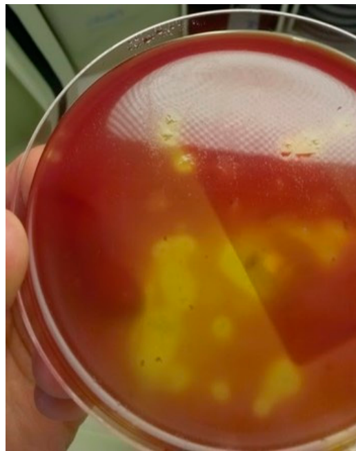
Figure 2. Colonies of Clostridium haemolyticum on fastidious anaerobe agar.

After 7 days of treatment with cefotaxime–metronidazole, the patient was treated with metronidazole IV for 3 days and then with amoxicillin IV for an additional 7 days. Since the patient was still afebrile, antibiotic therapy was stopped. At this time, hepatic cytolysis was no longer evidenced. However, because of a deterioration in her renal function (creatinine level: 76 mg/L), the patient underwent hemodialysis three times a week from day 13. On day 30, the patient, who had still a relatively well tolerated bicytopenia and was still afebrile, was transferred to the hospital center of Verdun. While her clinical condition was stable, she became feverish again on day 39. Three sets of blood cultures were sampled, and the patient was empirically treated with amoxicillin–clavulanic acid and clindamycin IV. After 24 h of incubation (BACT/ALERT system), one anaerobic bottle was positive with Gram-positive rods visualized by Gram stain microscopic examination. Broth blood aliquots of the positive blood culture were plated on a fastidious anaerobe agar (FAA) plate and inoculated in SB. All manipulations were performed inside an anaerobic chamber. After incubation in an anaerobic chamber, tiny \beta -hemolytic colonies were obtained on the FAA (Figure 2), while a slight growth was observed in SB.