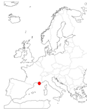
Figure 2. Presentation of the Camargue region and the use of the local equine breeds in this area.

In southern France, near the Mediterranean Sea, a regional park and nature reserve named “Camargue” houses particular flora and fauna adapted to saline conditions. This reserve is composed of marshes and wetlands of the Rhône Delta, spanning 150,000 hectares. Camargue horses live in semi-feral conditions in this area and are ridden by guardians/traditional breeders who raise Camargue bulls used in bullfighting. This traditional work is seen as a part of cultural heritage and is promoted during cultural events. This equine breed is also used in equestrian tourism to explore the Camargue region.