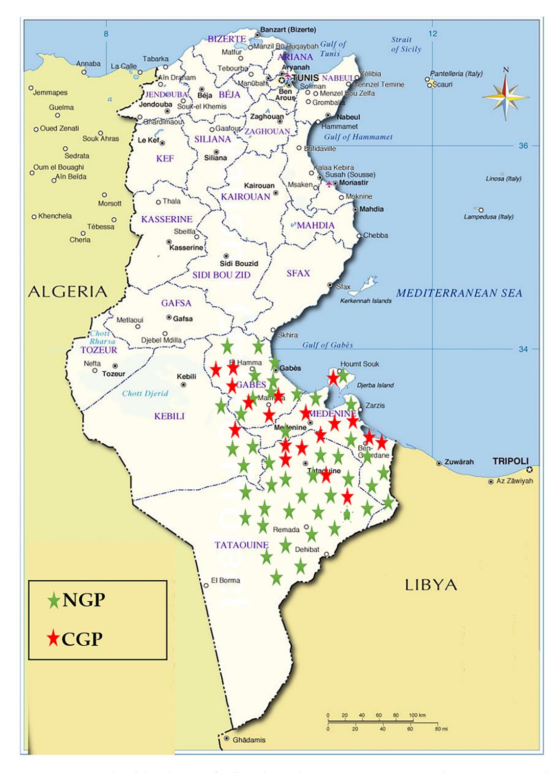
Figure 1. Geographical distribution of collected samples. NGP: native goat population; CGP: crossed goat population.

step at 94 °C (3 min) followed by 35 cycles of 30 s at 95 °C for DNA denaturation, 30 s for primer annealing at 57 °C and 1 min 30 s at 72 °C for primer extension, with a final extension step at 72 °C for 7 min. Sequencing reactions were performed with the primers T3 (5'-TTTACGTGGGCATATGATGC-3') and T4 (5'-GGCTGCAGGTAGACACTCC-3') using a BigDye Terminator Cycle sequencing kit v1.1 and an ABI PRISM 3130 apparatus (Applied Biosystems, Foster City, CA, USA). The sequences obtained have been aligned using Seq Scape v2.5.