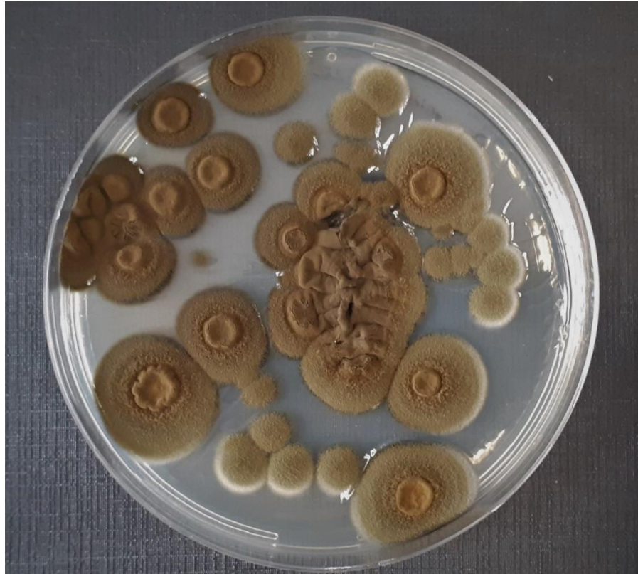
Figure 1. Macroscopical appearance of Exophiala spp. colonies, isolated from psittaciform birds, in Sabouraud chloramphenicol agar after 7 days of incubation.