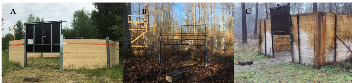
Figure 1. Pictures of the used corral-style traps. (A) Krefelder (Krefelder Saufang Vario, Thomas Vennekel & Georg Achten GBR, Krefeld, Germany); (B) JagerPro Trap System (Jager Pro ® , Inc. M.I.N.E. ® Trapping System, Columbus, GA, USA); (C) Selfmade trap type.

Three different types of corral-style traps were used to capture wild boar. All trap types were mobile with a floor area of 50\text{--}90\text{ m}^2 and designed to catch entire family groups. The Krefelder trap type (Krefelder Vario, Thomas Vennekel & Georg Achten GBR, Krefeld, Germany) and a Selfmade type were made of wooden planks between metal support, and the third trap type JagerPro (M.I.N.E. ® Trap System, Jager Pro Inc., Fortson GA, USA) was made of mesh wired wall elements (Figure 1). Traps were baited with corn following local restrictions. The closing of the trap was triggered in a controlled manner. A person not on site was informed about entering animals by wildlife camera and triggered the gate via radio or WIFI while watching the animals inside the trap via live video-recording. Wild boars were killed by headshot (rifle with .22 lr calibre) within a mean of 1 h and 32 min ( \text{Max} = 2\text{ h }17\text{ min} , \text{Min} = 39\text{ min} ) after trapping. In total, 10 traps ( Krefelder : n = 5 ; JagerPro : n = 2 ; Selfmade : n = 3 ) were used from October 2019 to August 2021, and 138 wild boars were caught in 27 trapping events (details in Table S2).