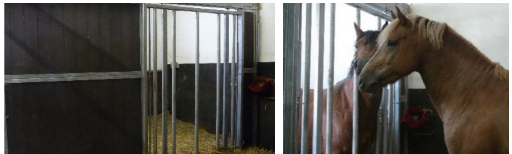
Figure 2. “Social box” stabling (SB) allows closer physical contact.

The experimental stable was arranged in one row of four SBs facing another row of four CBs. Each set of two consecutive box stalls was separated from the next set of box stalls by an opaque partition (Figure 3) so that each stallion could physically interact with only one neighbouring stallion. Openings situated over the box stall’s doors enabled every stallion to put their head into the corridor and to see his conspecifics stabled on the opposite side. The sixteen stallions were randomly divided into two groups of eight horses and randomly assigned to a CB or an SB in the experimental stable. Thereafter, these pairs of neighbouring stallions remained unchanged throughout the study. Each stallion was stabled for 20 days in a CB preceded or followed by 20 days in an SB.