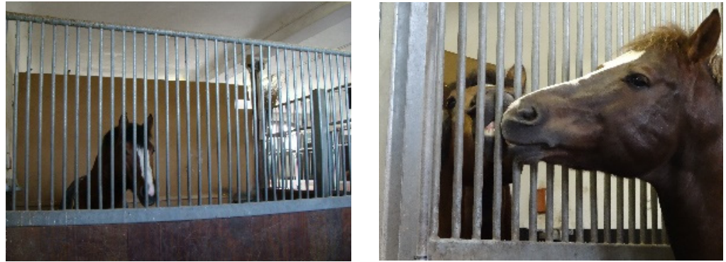
Figure 1. “Conventional box” stabling (CB) allows only restricted tactile contact.

consulting Switzerland, https://animalconsulting.ch , (accessed on 24 February 2023)). It comprised one part with vertical metal bars (from the ground to a height of 2.55 m) spaced at 30 cm, allowing the horses to pass their head, neck and legs to the adjacent box stall. The second part of the partition was solid, allowing the horses to visually isolate themselves from the neighbouring horse if they wanted to (Figure 2). The floor area of every internal stable was 9.3 m 2 .