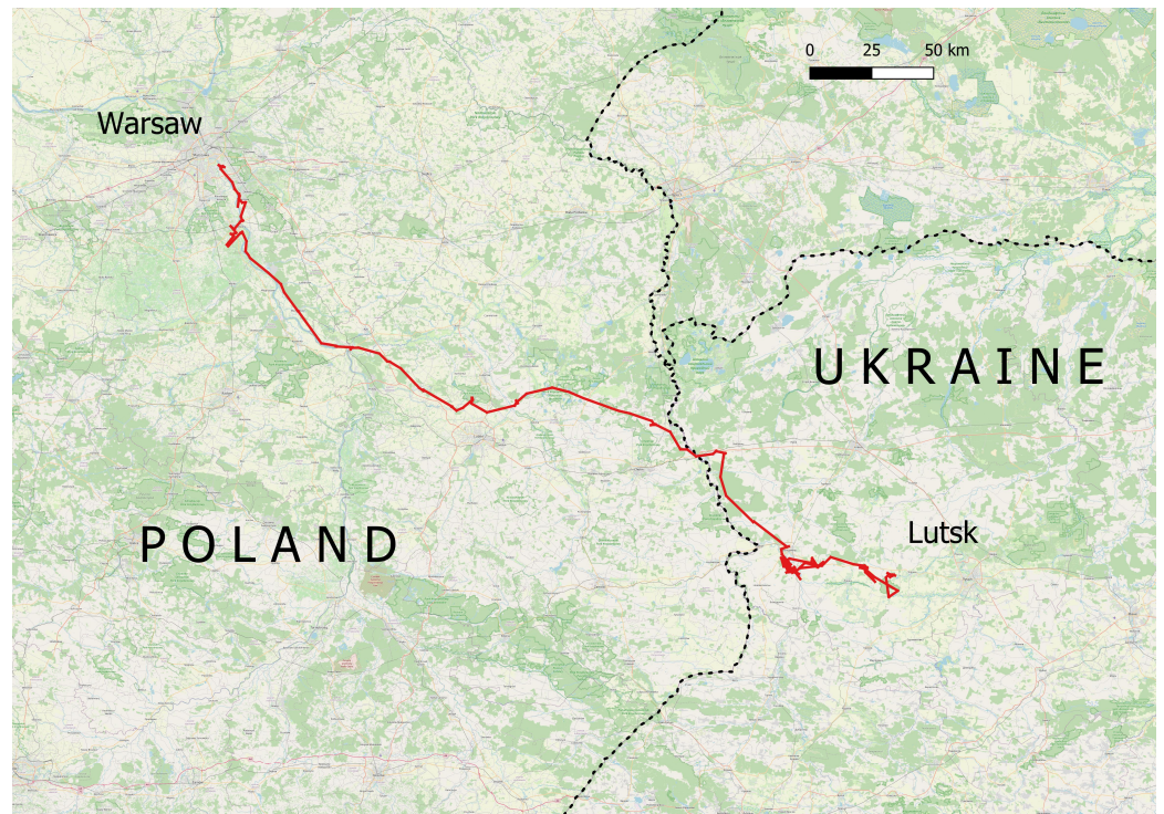
Figure 1. Route of wild boar GIGA 13's journey to Ukraine (period between 14 May and 24 August 2021).

We used the LSD method (straight-line distance between location points), which is commonly used in daily distance assessment, and represented a minimum daily distance, e.g., [27,31,32]. Using QGIS 3.30 software and a Python script developed through the PyQGIS library, we calculated the daily distance of both wild boars based on GPS locations from collars. Each iteration of the script analyzed two locations—the previous one and the current one—calculating the distance in meters considering the WGS84 ellipsoid. The minimum daily distance was calculated only for days for which there were at least two GPS locations and measurements from the previous or next day. We saved results in the attribute table of the layer and exported them to an .xlsx file. We divided the analyzed period for GIGA 13 into the “sedentary phase” and “nomadic phase”. The “nomadic phase” commenced on 14 May and was marked by a sudden increase in minimum daily distance to over 2.7 km followed by even greater increases in the subsequent days (Figure 2). The end of the “nomadic phase” coincided with the termination of the collar’s operation as long minimum daily distances persisted thereafter. For both periods (local movement and dispersion), we calculated the maximum values of minimum daily distance, the average value, the standard deviation, and the median. These statistics were also computed for the entire analyzed period for the GIGA 17 male.