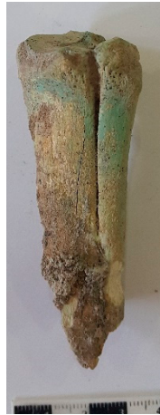
Figure 7. A pathological lesion was found on a mule's metatarsal bone (Basket No. 60021) from the EBA III/Karum Period.

(p. 208) and [46]. The side MT is attached to the main MT (III) as a result of the individual's hard work over time (Figure 7).