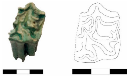
Figure 3. An upper molar from the Early EBA III Period, belonging to a donkey (Basket No. 70141).

A lower jaw molar (Basket No. 8493) from the Late EBA III Period is classified as a mule, particularly due to the deep penetration of the buccal fold into the so-called “neck” (Figure 4) (compare Johnstone 2004: Figure 4.3c and Table 4.1).