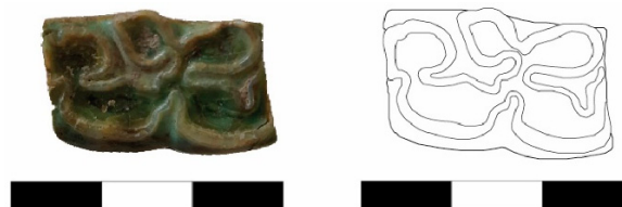
Figure 5. This is a lower jaw molar of a donkey (Basket No. 60130) from the EBA III/Karum Period.

A lower jaw molar (Basket No. 60130) from the EBA III/Karum Period has been identified as belonging to a donkey. This conclusion is based on features such as the absence of penetration of the buccal fold into the so-called “neck”, nearly symmetrical rounded double knots, and a shallow “V” shape lingual fold (Figure 5) (compare Johnstone 2004: Figure 4.3b and Table 4.1).