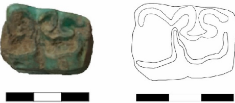
Figure 4. A lower jaw molar of a mule (Basket No. 8493) from the Late Early Bronze Age III Period.

A lower jaw molar (Basket No. 8493) from the Late EBA III Period is classified as a mule, particularly due to the deep penetration of the buccal fold into the so-called “neck” (Figure 4) (compare Johnstone 2004: Figure 4.3c and Table 4.1).