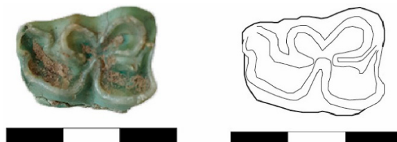
Figure 6. A lower jaw molar of a mule (Basket No. 60074) from the EBA III/Karum Period.

Once again, a lower jaw molar (Basket No. 60074) from the EBA III/Karum Period is classified as a mule due to its deep “V”-shaped lingual fold and the deep penetration of the buccal fold into the so-called “neck” (Figure 6) (compare Johnstone 2004: Figure 4.3c and Table 4.1).