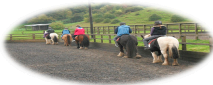
Figure 8. Shared and expanding spaces, creating “common worlds” and new “territory”.