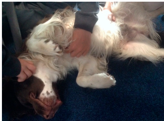
Figure 1. Ted’s “springer sprawl”—using his body language to “talk” and initiate tummy and chest rubs from the children.

The study was conducted over a full academic year. In order to apprehend the children’s experiences of their encounters and interactions with Ted, a non-representational, visual and sensory ethnography was employed. As affect often goes unnoticed and uncognitised [3], a way of understanding their experiences and relational process with a dog meant the emergence and development of a robust methodology and protocol that afforded embodied ways of knowing. This enabled the elicitation of expression through non-textual modes (creative media). The visual materialisation of the children’s lived experiences with Ted are therefore also an embodied process in itself. Thus, the limitations of language and uncovering affect (often silenced through a flat ontology) are made possible. Through describing embodied and inter-corporeal experiences, of both participants and researcher, we reveal new insights and knowledge of this significant aspect of child–dog relationships. This is a fundamental aspect of this research. It encapsulates the importance of