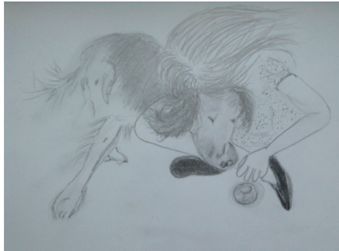
Figure 2. Jenny and Ted intimately intertwined in body.

This is further revealed in the “etudes” (drawing exercises) below (Figures 2 and 3).