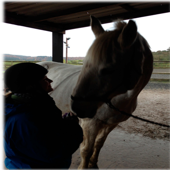
Figure 5. Human-horse “mirroring” and relating.

may, as Rothe et al. [42] suggest, encourage the growth of self-esteem, which “may be increased through a new found ability to positively influence another being”. Once a relationship between a horse and a human is established, rapport begins to grow. This in turn gives a feeling of inner pride, empowerment and accomplishment [46] (see Figure 6).