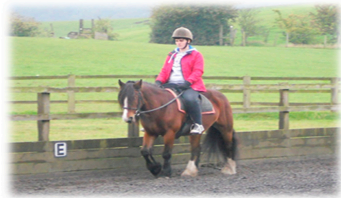
Figure 7. Human–horse rhythm, becoming “rhythmanalyst” (aware of one’s body rhythm) and in tune with one another.

a repetition of sensory affectedness and kinetic intensities calling for a body (rider or walker) to tune into its senses, transcending the body and mind dichotomy, to become what is termed rather befittingly a “rhythmanalyst”—becoming aware of one’s body rhythms and movements [49]. The elusive essence of affect can therefore become materialised in and through these studies by their interplay of both text and image. As seen in Figures 7 and 8, the rhythm of riding (canter, trot) can also evoke both hypoarousal and hyperarousal states [39], thus being calming and regulatory and as well as improving attention and focus. This is also seen in Study A forming a “common ground”. This is noteworthy as these states are related to affect attunement with the dog and horse, both affording a way of relating in an inter-corporeal way.