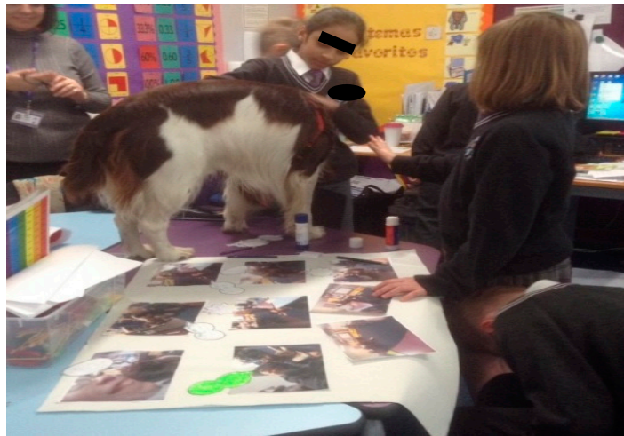
Figure 10. Making comic panels with Ted, telling a story with visual-material methods.

Through mapping and drawing out the lines of the event [55,56] (interactions between humans-horses and humans-dogs), we can offer the image, etudes (drawings), photographs and artwork (as cartography and map, shown in Figure 11a,b as a way of stepping outside of usual assumptions and interpretive methods to depict new and exciting configurations of relationships which encompass non-human beings. These new forms of “seeing” are beyond linguistics and make visible bodily affects. This affect may otherwise be lost in transmission between bodies as merely “felt” experiences and go unknown or unspoken.