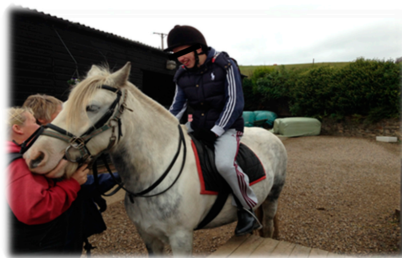
Figure 6. Embodied transformation. “... like a legend being on top of them. You feel so big. You feel like a boss because you’re so big. I like being on a big horse. I feel massive...I feel better.”

The benefits of association with and positive interactions between young people and horses are multi-layered and include “care translation, socialisation and conversation, self-esteem promotion, companionship and affection stimulation” [42]. It is conceivable that these benefits can be integrated into the young person’s sense of self and transferred to other arenas of their lives. This natural ability to attune to others, to observe, evaluate and respond authentically and immediately to non-verbal attitudes and behaviours means that horses are ideal therapy and companion animals [47].