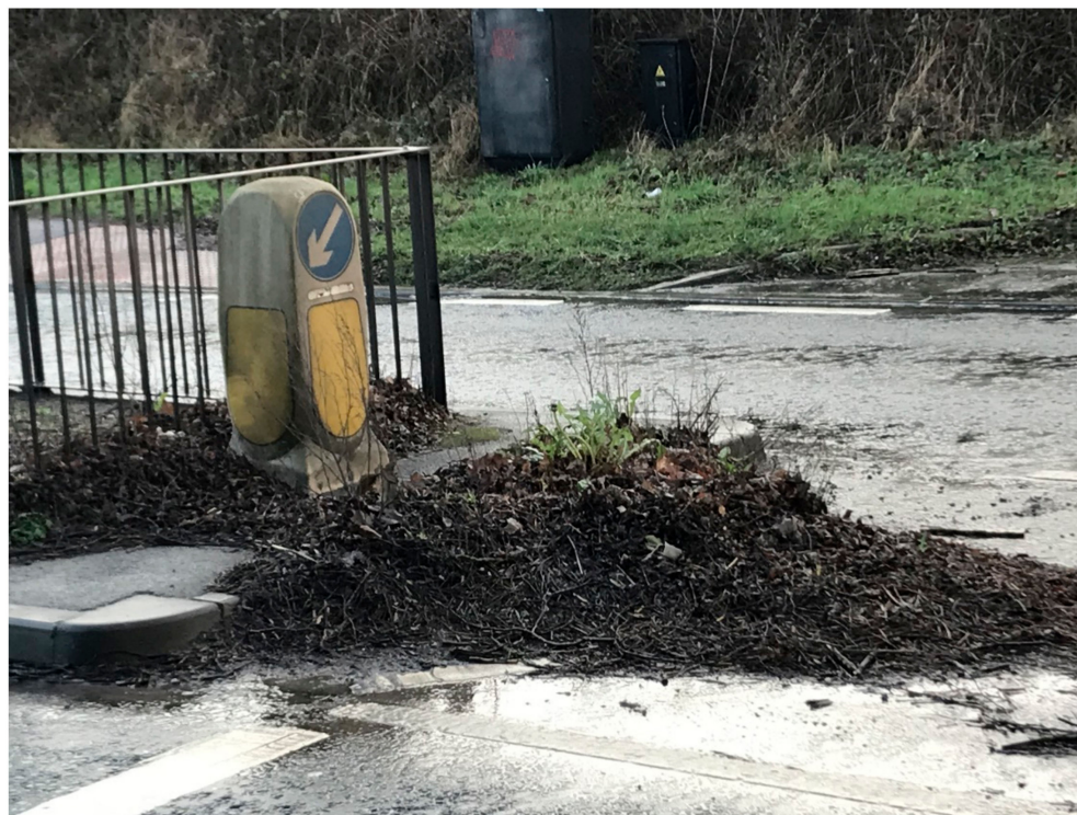
Figure 3. Entrained waste material behind road furniture at an urban setting in the UK. The material comprises a combination of natural leaf litter, sludge, and vehicle components.

Poor air quality is no respecter of boundaries. The rapid global circulation of contaminated air was illustrated very clearly by the nuclear disasters at Chernobyl, in 1986, and Fukushima [66,67]. Similarly, when Eyjafjallajökull erupted in Iceland in 2010, international airspace was closed for several days [68]. ‘Saharan rain’ is a phenomenon often observed in northern Europe [69]. Each of these is also an indicator of ‘what must go up must come down’. Although the latter two examples are not anthropogenic in origin, and are therefore beyond control from an immediate air quality perspective, once they have gone through the ‘must come down’ element of this cycle, they indicate the global nature of atmospheric contamination and become a part of the general sludge which washes off our windows, buildings, cars, and other hard structures, into roads, gutters, and drains, to be resuspended in the atmosphere in the next dry spell.