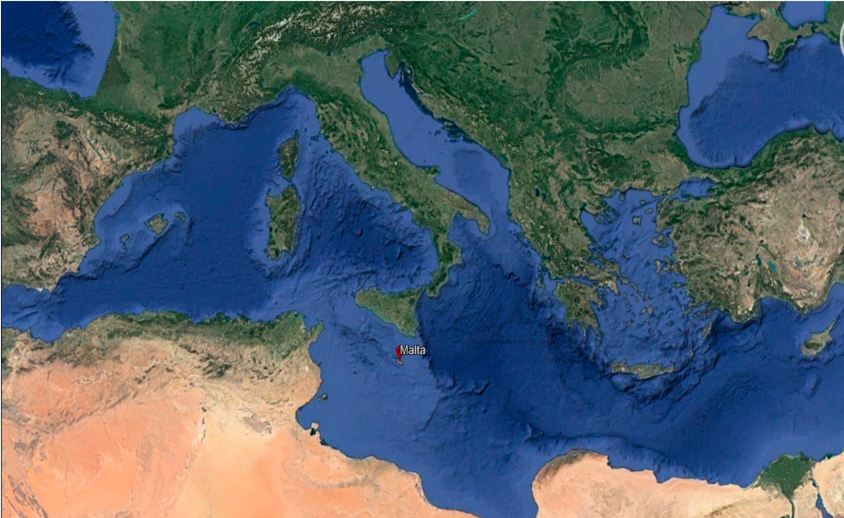
Figure S1. The geographical location of Malta in the centre of the Mediterranean.