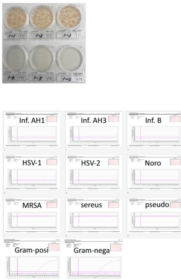
Figure S1 Negative testing of commercial hygiene products.