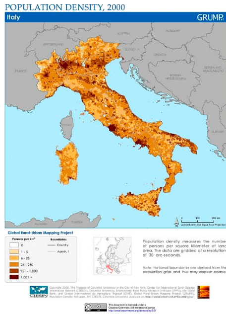
Figure 2S. Map of Italy’s Population Density Patterns [S3].