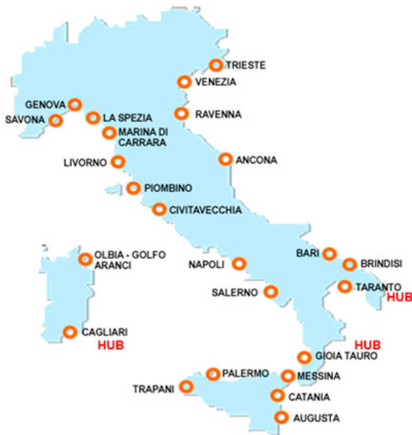
Figure 3S. Map of Italy’s Core Network Ports and Other Major Ports a [S4].