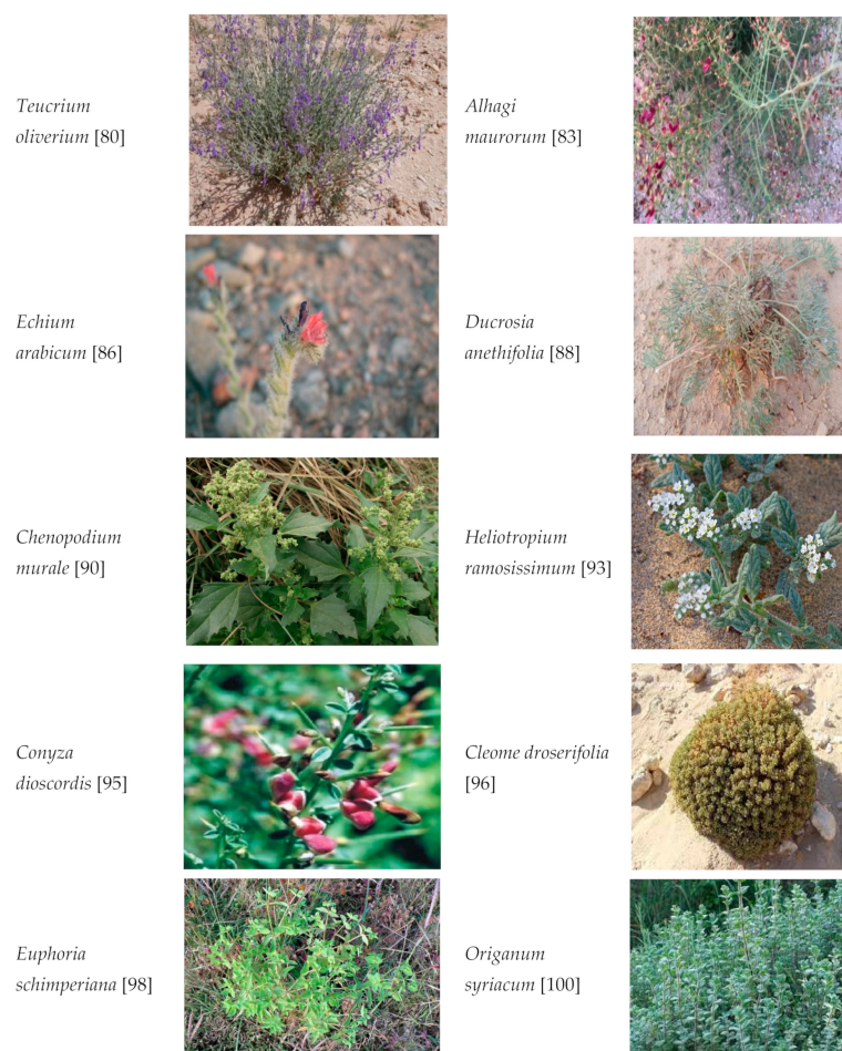
Figure 1. Diagrammatic representation of potential antimutagenic plants of Saudi Arabia.