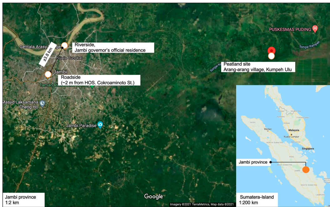
Figure S1. Sampling site in roadside, riverside, and peatland area in Jambi city, Indonesia.