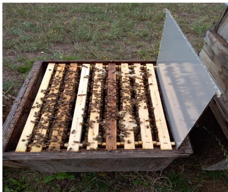
Figure 1. The mobile divider is composed of a PVC sheet coated by two aluminum layers.