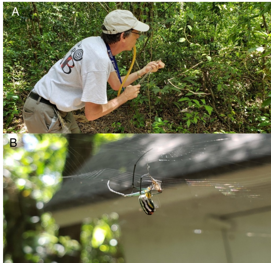
Figure 1. (A) In the mosquito handling procedure, mosquitoes were propelled toward the web with a light puff of air, being careful not to blow air directly at the spider. (B) An adult female L. argyrobapta subdues a mosquito ( W. vanduzeei ) that had been propelled into the web.

The mosquitoes we used were an even mix of wild Ae. aegypti , and Wyeomyia vanduzeei , captured locally with a BG-2 Sentinel trap (Biogents, Regensburg, Germany). Twenty-one webs were sprayed with permethrin and 16 with the acetone control. Using a mouth aspirator (John W. Hock Company, Gainesville, FL, USA), we aspirated five mosquitoes at random from the mosquito cage and propelled them toward an intact section of the web. Before conducting the trials, we practiced on untreated webs until we could reliably expel mosquitoes at the correct velocity to strike the web but not break the strands. Preliminary trials determined that undisturbed L. argyrobapta readily capture and consume any mosquito that sticks in the spiral web for at least three seconds (Figure 1). During the trials, we noted whether mosquitoes stuck to the web for 3+ s, whether the spider seized a stuck mosquito, and the latency for the spider to respond to the web strike.