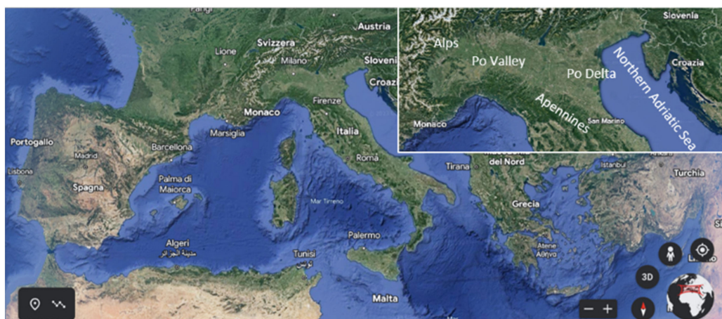
Figure 1. Map of the Mediterranean Sea with details of the Northern Adriatic and the hydrographic basin of the Po Valley (bottom left corner: Lat. 43.324050 N, Lon. 6.547654 E; top right corner: Lat. 46.537197 N, Lon. 16.027382 E;).