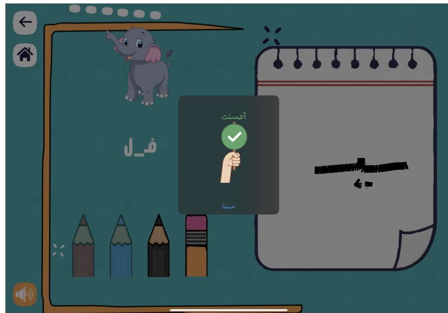
Figure 5. Feedback interface.

Then, we implemented user acceptance testing, which is a necessary step before releasing software into the real world. It is used to ensure that the application accomplishes what it aims to do and meets the requirements [27]. We conducted user acceptance testing with 11 users. The participants were between 7 and 12 years old. The evaluation was based on three usability criteria: effectiveness, efficiency, and satisfaction. We recorded the time it took users to perform a particular function to ensure efficiency. To evaluate the application’s effectiveness, we calculated the average number of errors in certain tasks and the average time it took users to complete the tasks, using both the stylus and the finger, for the application’s target group.