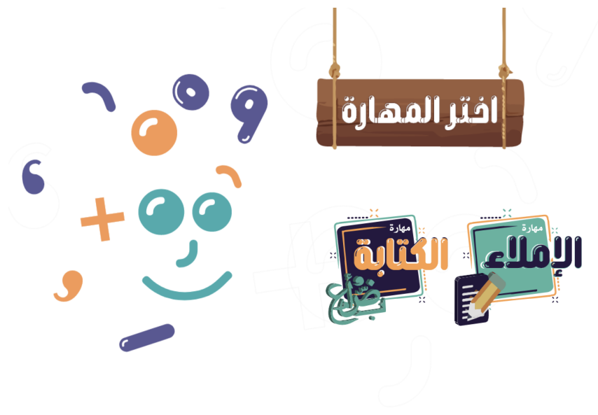
Figure 3. Homepage interface.

We developed a prototype that integrates the CNN model into a useful tablet application for children to practice Arabic handwriting and spelling skills. First, we created a questionnaire to investigate the need for the development of an educational application to practice writing and spelling skills in Arabic and to gather functional requirements for such an application. We collected information from eight teachers. The results indicated that there was a need for the development of an application with essential and attractive features to encourage children to practice spelling and writing skills. Moreover, the results helped us to identify the most important functional requirements to build an application appropriate for the target audience. The target user is between 7 and 12 years old. The application offers two options: practice writing Arabic letters and practice spelling skills, as presented in Figure 3. The application allows a user to practice writing by displaying the writing board, which contains pens of different colors and an eraser, as presented in Figure 4. Moreover, the user receives appropriate feedback based on the input, as presented in Figure 5. Considering children are the main audience, the application was designed to be very clear and easy to use and understand.