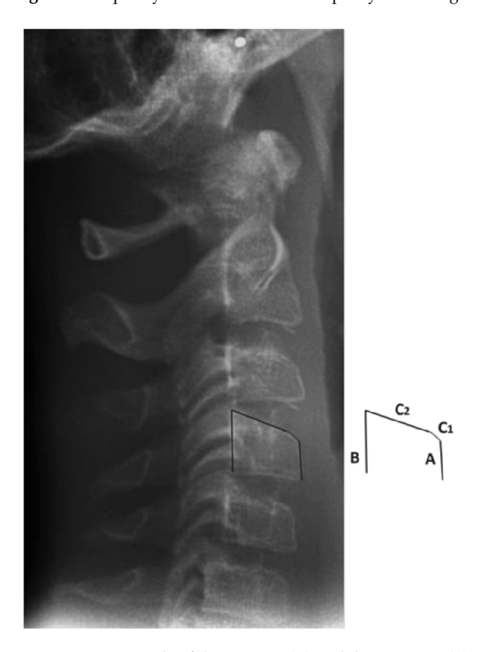
Figure 2. An example of the anterior (A) and the posterior (B) sides of the fourth cervical vertebral body. The anterior side of the body is measured up to the point where the anterior side (A) curves (C1) towards the superior side (C2) of the vertebral body.