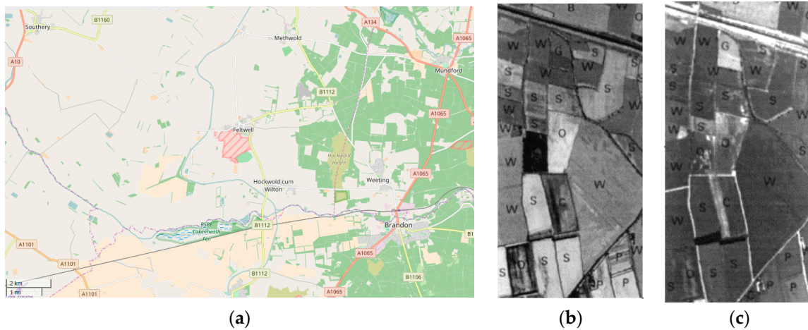
Figure 2. Data for Feltwell. (a) The location of Feltwell, © OpenStreetMap contributors; (b) airborne thematic mapper (ATM) image extract in waveband 4 and (c) ATM image extract in waveband 7.