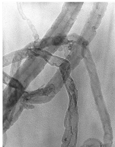
Figure S2. TEM micrograph of f-CNT material.