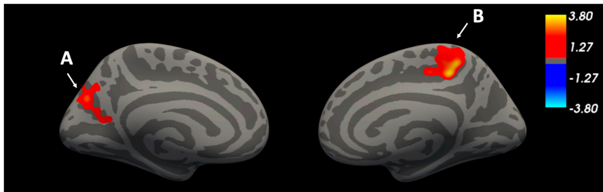
Figure 2. Impulsive urgency predicts greater cortical thickness in two clusters, adjusting for age, sex, and BMI. (A) Left superior parietal lobule, precuneus, superior occipital gyrus, and cuneus. (B) Right paracentral lobule, precuneus, and posterior cingulate gyrus.