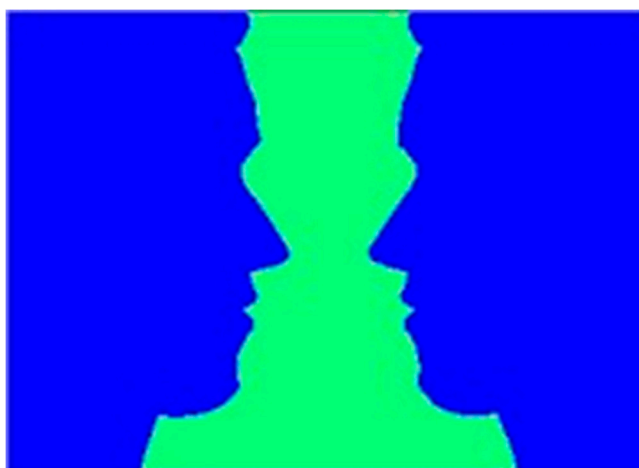
Figure 1. A color-gustatory synesthete, E.C., reported that the blue “tasted very sweet” and the green tasted “fresh, like rain with no humidity, a hint of cilantro, slightly tangy”. In this figure, both tastes were not experienced simultaneously. The taste depended upon the color of the figure that was perceived—faces or urn. Her synesthetic tastes ‘flipped’ along with her visual reversals.

The purpose of the present study was to determine whether E.C.’s color-gustatory synesthesia could also be modulated at a sensory level. We investigated this by determining whether a sweetness blocker, Gymnema sylvestre , when applied to the tongue, could influence E.C.’s synesthetic sweetness. E.C. reported that her synesthesia occurs in her mouth and tongue, which is consistent with accounts from other individuals experiencing synesthetic taste [3,4,11,14] Clearly, this does not imply a sensory origin—the synesthetic taste originates as an association in the brain, even if it is referred back to the mouth. However, some form of sensory modulation might be possible. An apparently adequate test by applying a real taste to the tongue while simultaneously inducing a taste could be problematic because E.C. does not experience synesthetic taste blends, as illustrated by Figure 1, rather she experiences one taste or the other, but not a combination. Therefore, the hunt was on to find a taste modulator that could affect the tongue in the complete absence of gustatory stimuli (food or liquid). The sweetness blocker, Gymnema sylvestre , was used because it blocks only sweetness, leaving other tastes unaffected.