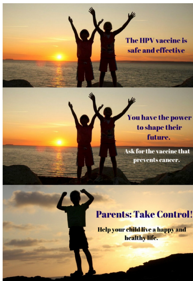
Figure 1. Top three performing ads.

Formative audience research led to the insight that parents in South Carolina are compassionate, caring, and thoughtful. They want to do what is best for their children and their families. As a result, HPV Vaccination NOW aimed to raise the voices and stories of parents in the state as primary, trusted messengers. Messages focused on compassion and the understanding that all parents want to do what is best for their children and families. The campaign also focused on empowerment and appealing to parents' moral responsibility and personal choice to protect their children against cancer. The campaign capitalized on progress and momentum by focusing on South Carolina's significant improvement in vaccination rates. In line with national campaigns, HPV Vaccination NOW emphasized cancer prevention, normalizing HPV vaccination as a routine part of the vaccination series, and the safety, effectiveness, and long-lasting protection of the HPV vaccination. A social media editorial calendar was created with 3–5 posts per day on Facebook and Twitter with a different theme each week (see Table 1). A partner toolkit was developed which included one post per day, and it was disseminated to likeminded organizations who shared the posts with their networks to amplify the campaign's messages.