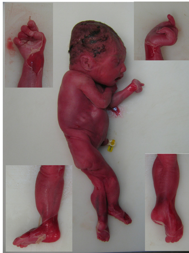
Figure 2. Lateral view of the fetus. Lateral view of the fetus shows skin slippage due to maceration. Both hands show medially overlapping fingers (upper insets) and left pes equinus (lower insets).