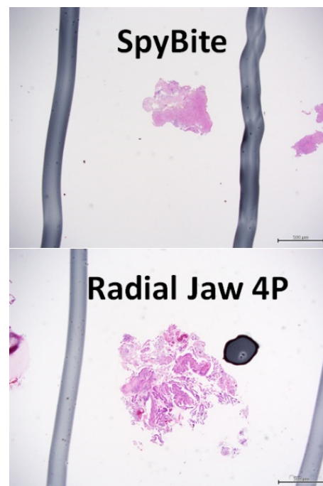
Figure 4. Microscopic images of pathological samples obtained by peroral cholangioscopy-guided and fluoroscopy-guided biopsy. Pathological samples from cholangioscopy-guided biopsies ( upper panel ) and fluoroscopy-guided biopsies ( lower panel ).

The larger biopsy samples obtained from fluoroscopy-guided procedures rather than POCS-guided procedures should make pathological interpretation of biopsy specimens easier and more accurate. Previously, an RCT was conducted to compare the diagnostic sensitivities of fluoroscopy-guided transpapillary biopsy using large-sized forceps (cup size of 2.2 mm) and standard-sized cup forceps (cup size of 1.8 mm) in the diagnosis of extrahepatic biliary stricture. The results showed that the large-sized forceps provided better sensitivity than the standard-sized forceps (70% versus 43%) [24]. Thus, the cup size of biopsy forceps correlates with the quality and quantity of the biopsy specimen. If the same size caliber forceps were available in both procedures, the sensitivity of a POCS-guided biopsy may be better than that of a conventional fluoroscopy-guided biopsy because more precise target biopsies can be collected using a POCS-guided biopsy. Therefore, the development of small-diameter biopsy forceps with a larger cup size or a POCS with a larger biopsy channel is strongly desired. Recently, new biopsy forceps for SpyGlass (SpyBite Max biopsy forceps, Boston Scientific Inc.) became commercially available. These new forceps may improve the quantity and quality of biopsy samples. In addition, large-volume samples may be beneficial for molecular profiling of the tumor, which is becoming important for biliary cancer as well as other cancers.