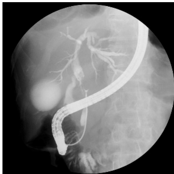
Figure 2. Fluoroscopic image of a fluoroscopy-guided biopsy in a case of suspected bile duct cancer.

Following the POCS-guided targeted biopsy, the cholangioscope was withdrawn from the duodenoscope, and the fluoroscopy-guided transpapillary tissue sampling was performed using conventional biopsy forceps (Radial Jaw 4P; Boston Scientific Inc., Natick, MA, USA) through the working channel of the duodenoscope (Figure 2). The cup sizes of the biopsy forceps are shown in Figure 3. Each biopsy from a bile duct stricture suspected of biliary malignancy was performed a minimum of two times. However, the actual number of biopsy samples obtained was determined by the endoscopist based on the macroscopic volume of the biopsy sample and the patient's condition.