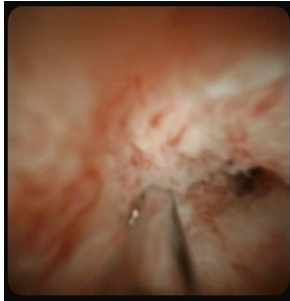
Figure 1. Targeted biopsy under direct vision of peroral cholangioscopy in a case of suspected bile duct cancer.

two modularized components: a sterile, single-use cholangioscope with a 1.2 mm diameter working channel and a combined image processor and light source. After careful observation of the lesion using the cholangioscope, POCS-guided tissue sampling was performed on the targeted biliary lesion using dedicated biopsy forceps (SpyBite Biopsy Forceps, Boston Scientific Inc.) under direct cholangioscopic vision (Figure 1).