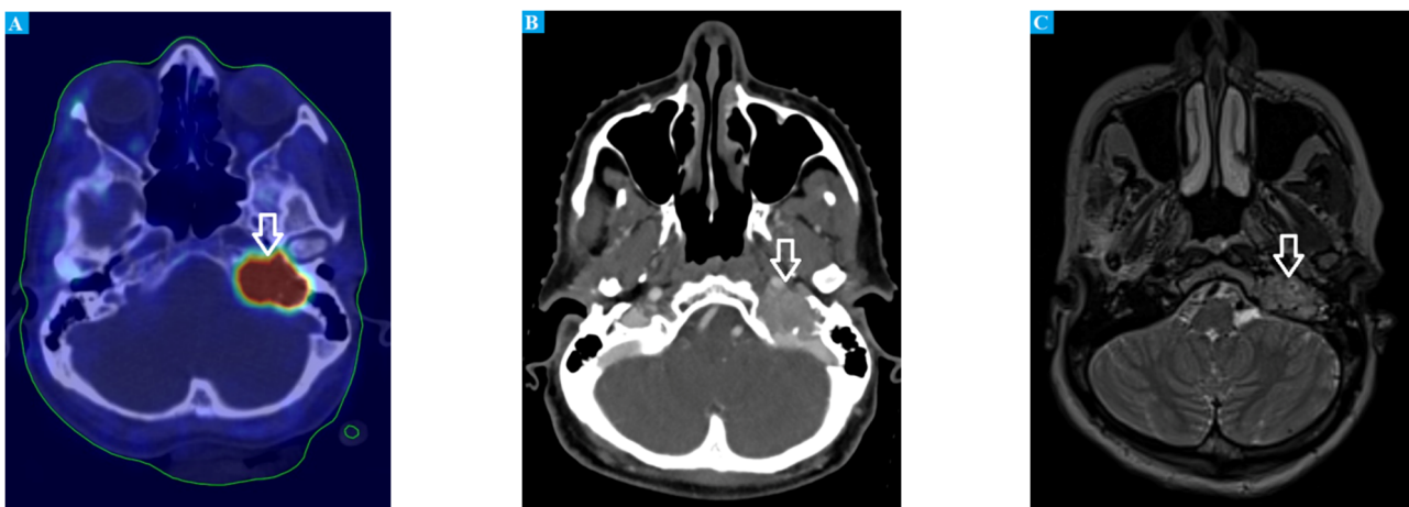
Figure 2. (A) combined ^{68}\text{Ga} -DOTATE PET and CT images showing a large, highly metabolically active mass in the skull; (B) CT scan showing a polycystic tumor compressing the left cerebellar tonsil; (C) combined MR and CT scan showing infiltration of the left sublingual nerve extending to the left internal carotid artery canal and obstructing the left internal jugular vein at the inferior bulb region.