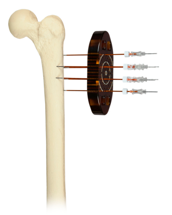
Figure 1. Femur model showing electrode needle placement with a plastic mask used to hold the needles in the correct position during treatment.

The aim of our review is to evaluate the results of ECT in the treatment of bone metastases.