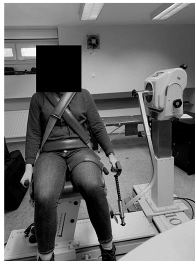
Figure 1. Configuration and position of the Biodex System 4 Pro for performing shoulder flexion/extension exercises (initial position).

A standard adapter for the upper limb was used to test the muscle strength of the shoulder joint. The equipment calibration procedure was carried out in accordance with the manufacturer's recommendations. During the examination, the patient was in a sitting position, and the examined upper limb was straightened. In order to stabilize the body and eliminate compensatory movements, the patient was fastened to the chair with belts—on the chest and pelvis. The acromion process was taken as the axis of joint rotation. The subject then grasped the handle of the dynamometer. The initial position for each measurement was lowered arm along the torso (Figure 1).