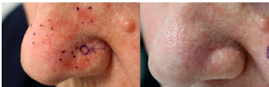
Figure 1. Complete clinical response to photodynamic therapy (PDT), as clearance of actinic keratoses in the nasal area of a patient six weeks after treatment.

As expected, PDT induced a significant reduction in the mean number of AKs per patient, from 7.80 (SD 2.79) to 2.8 (SD 1.61) ( p = 0.005 ) (Figure 1). Overall clinical response was complete in 16 patients (64%) and partial in 9 (36%); there were no cases without response.