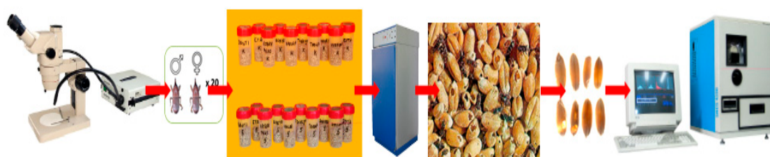
Figure 2. Scheme for obtaining empirical data [17].