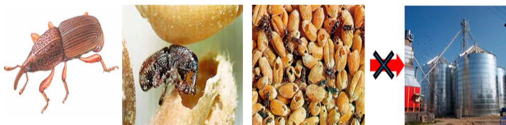
Figure 1. Grain weevil ( Sitophilus granarius L.) in the context of the grain storage process [16].

Grain weevil ( Sitophilus granarius L.) (Figure 1) is a winged cosmopolitan beetle from the Curculionidae family. Although it belongs to the subclass of the winged insects, it is deprived of volatile wings. It belongs to the group of the most damaging storage pests. Depending on the age of the individual, the grain weevil's color ranges from light-brown to black.