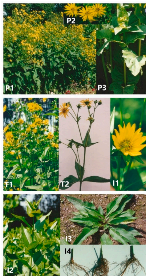
Figure 1. Silphium plants: P- S. perfoliatum (P1—three-year-old plants, P2—inflorescences, P3—shoots) T- S. trifoliatum (T1, T2—shoots), I- S. integrifolium (I1—inflorescences, I2—shoots, I3—one-year-old plants, I4—rhizomes with roots).