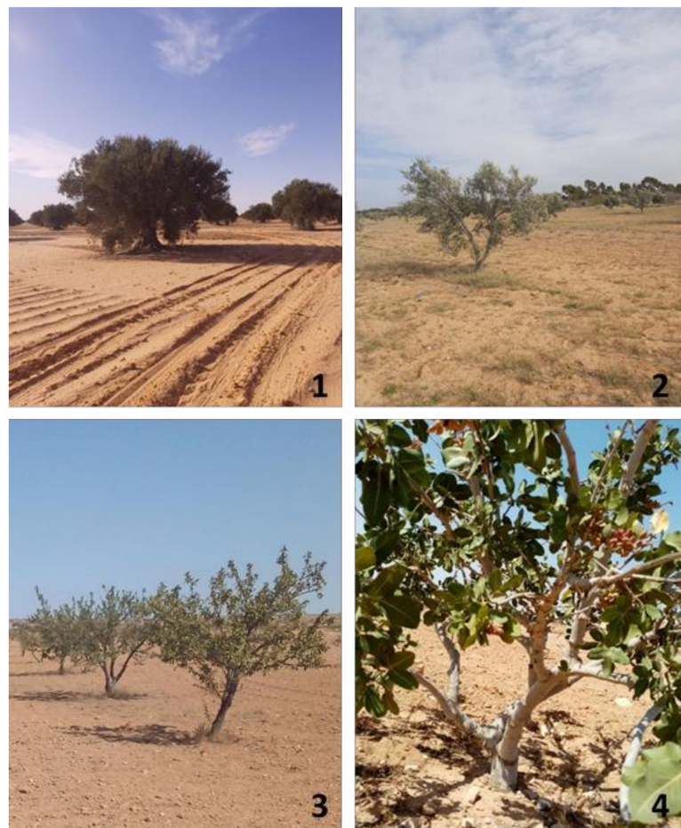
Figure 2. Different land uses in the experimental farm: Centenary olive grove, young olive grove, almond tree, and pistachio tree. (1): Centenary olive grove—old cultivated > 100 years; (2): young olive grove—newly cultivated < 12 years; (3): almond tree—newly cultivated < 12 years; (4): pistachio tree—newly cultivated < 12 years.

All soil samples were taken at the same time (synchronic approach) under different management practices at known durations from an initial reference state, and the SOCS was compared under this initial reference state [53].